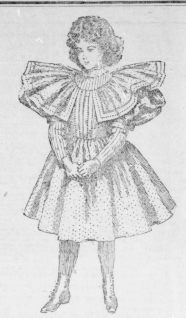
A DAINTY GUIMPE FROCK

His sides are full of small holes made by a brad in the end of a stick, when he has And went to his work with a cheerful air; O beautiful flowers of Paradise!