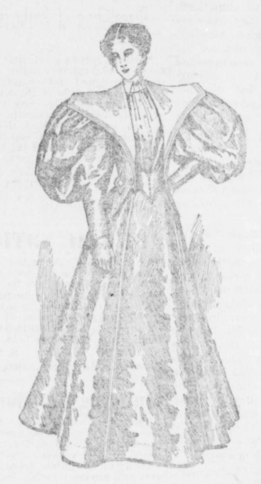
CHINA BEUE DUCK RELIEVED BY WHITE.