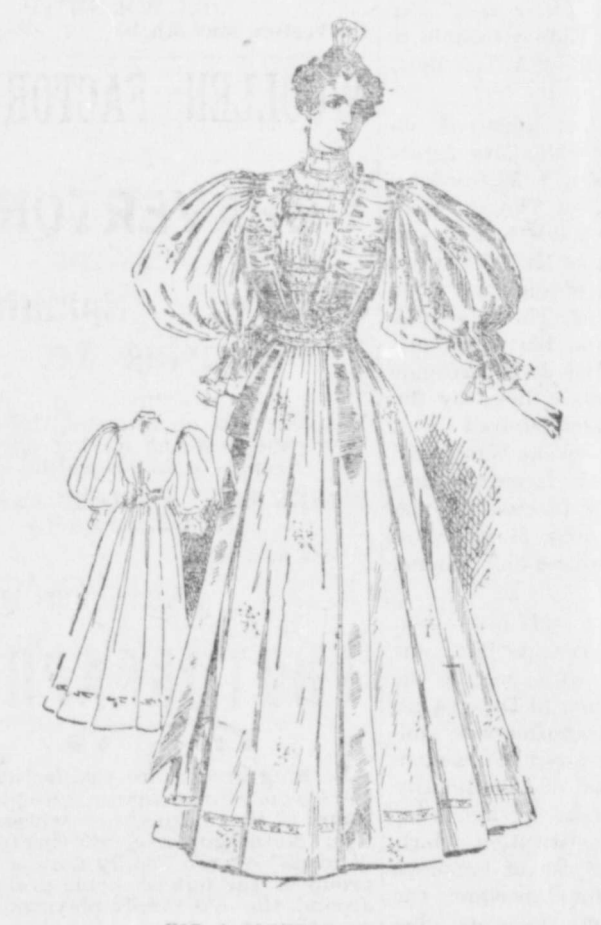
FOR A SLENDER FIGURE.

The Rose Had Bloomed But the He talked to the plant when all alone Man Was Dead.