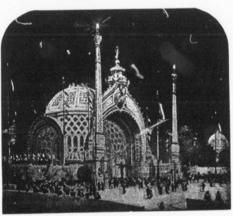
MAIN ENTRANCE, PARIS EXPOSITION

But perhaps the most objectionable of all hackneyed phrases are those quotations (or misquotations, as they frequently are) of Bible language with which many alleged testimonies or prayers are interlarded ad nauseam. To catalogue these would exhaust the space allotted to this article, and would, furthermore. be superfluous, for most readers of the ERA are sufficiently faithful to the class and prayer meeting to be quite familiar with a large part of the list. I knew a man who had quite a reputation for Biblical lore on account of his habit in the testimony meeting of repeating a long series of texts from various parts of the Scriptures, whose connection with each other could only be traced by reference to the mysterious workings of the laws of association. In fact this good brother was practically an automaton, for having risen to his feet, closed his eyes and opened his