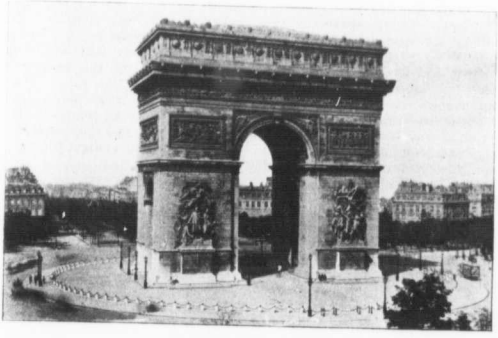
ARC DE TRIOMPHE, PARIS.

THIS is a secret of attainment, of progress, of true success—"daily self-surpassed." To surpass one's self, and not to surpass others, is the only true achievement. When a scholar