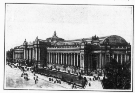
GREAT PALACE OF ART, PARIS EXPOSITION.

In the "resting times" of our Lord, the Christian, who dozes away Sunday with