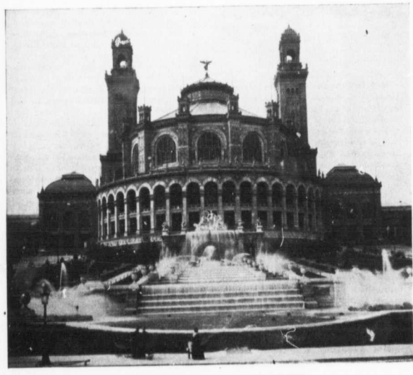
THE TROCADERO PALACE, PARIS EXPOSITION.

It is expected that fifty million persons will visit Paris during the present summer. This estimate does not seem so unreasonable when it is remembered that