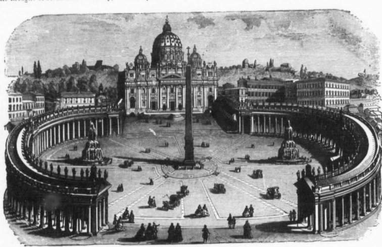
ST. PETER'S CATHEDRAL, ROME.

though I confess myself disappointed at the external appearance of the edifice itself. It seemed to me proportionately low, and not majestic enough for the environments. Above it soars the Vatisweeping out from the sides are the enormous colonnades already spoken of; quadruple rows of scores of gigantic marble columns in circuit and under entablature, affording long alleys of payement amid the columns ranged in line as you approach the central entrance from either side. The entire scene, and not any one part thereof, must be encompassed in the view to produce the impression designed by the successive architects upon the mind. So looked upon, we have an impressive unity and quiet majesty. An Egyptian obelisk, one of several plundered by old Rome from older Egypt, stands in the centre of the court, and ninety-six colossal statues crown the entablature of the four rows