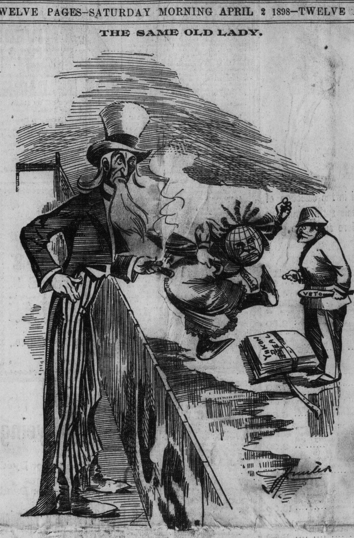
THE GLOBE (to policeman who has been interfering with some of her friends): Yankee tool! Yankee tool! You want to give away the Yukon trade to the Yankees.

THE SAME OLD LADY. THE GLOBE (to policeman who has been interfering with some of her friends): Yankee tool! Yankee tool!