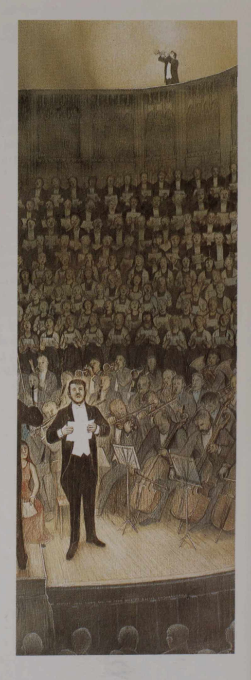
Above, Early Afternoon on Scarborough Bluffs, mixed media, 48 x 24 inches. Right, Handel's Messiah at Massey Hall, mixed media, 39½ x 14 inches. Opposite, It's Hard for Us to Realize, mixed media, 23¼ x 48 inches.