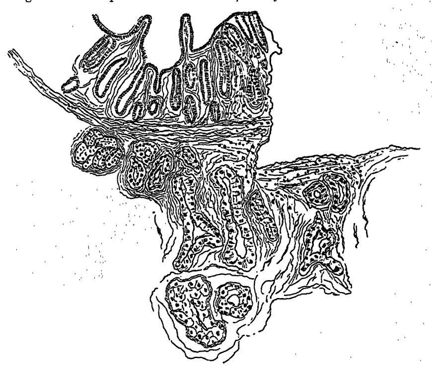
CASE II.—Section of bile papilla showing proliferation beginning in the duodenal glands at site of ulceration.

infiltrating glands, numerous solid nests of epithelial cells were lying between the muscle bundles. The cells are no longer of the cylindrical character, but rather spheroidal or polymorphous, with large round nuclei. Within this area are alveoli in whose centre mucoid degeneration has set in leaving only the outer rim of cancerous cells. A few of the outermost lobules of the head of the pancreas showed some infiltration of the tumour, but clearly differentiated from the parenchyma of the organ. Secondary metastases were present in the lymph glands of the lesser omentum, as far up as the hilus of the liver, but no secondaries were found in the liver itself. The cells of the metastases were larger and more spheroidal than at the primary seat.