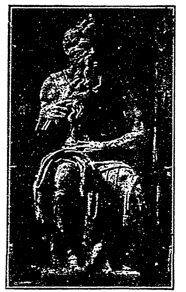
MOSES: By Michael Angelo The horns in the forchead are the emblem of power.