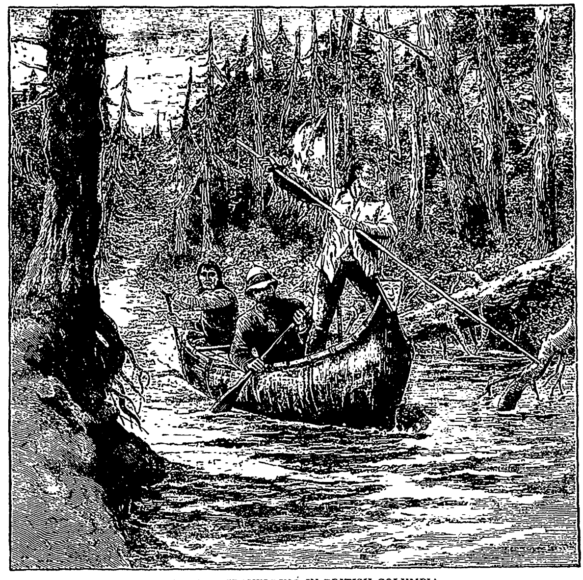
MISSIONARY TRAVELLING IN BRITISH COLUMBIA.

lett to sing a solo. This he did as if enduring great agony, always ending with the words, 'Go away! Go away!' in English. Of course I did not go. Presently there was a pause, of which I quickly took advantage to stand up and speak, taking them, as it were, in the flank, for they only paused a moment, that they might come down on their tomtoms all together. They did not attempt to interrupt me, but sat, as it were, in a state of suspension and surprise, listening, it seemed almost unconsciously, while the truths of the Gospel flashed in upon them through the darkness. Some at length began to be ashamed, some sullen, and others angry; but I had said what I wanted to say, and departed before they could recover themselves.