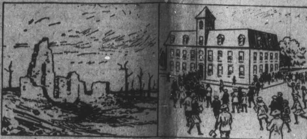
7,290 schools destroyed at the time of the Armistice.