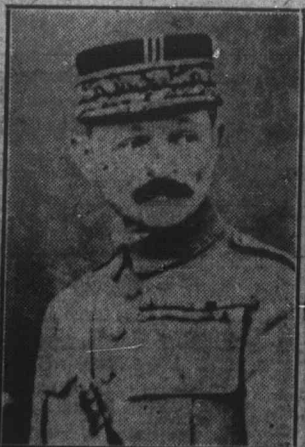
General Weygand, Marshall Foch's Chief of Staff, who may be appointed High Commissioner for the occupied Ruhr district.