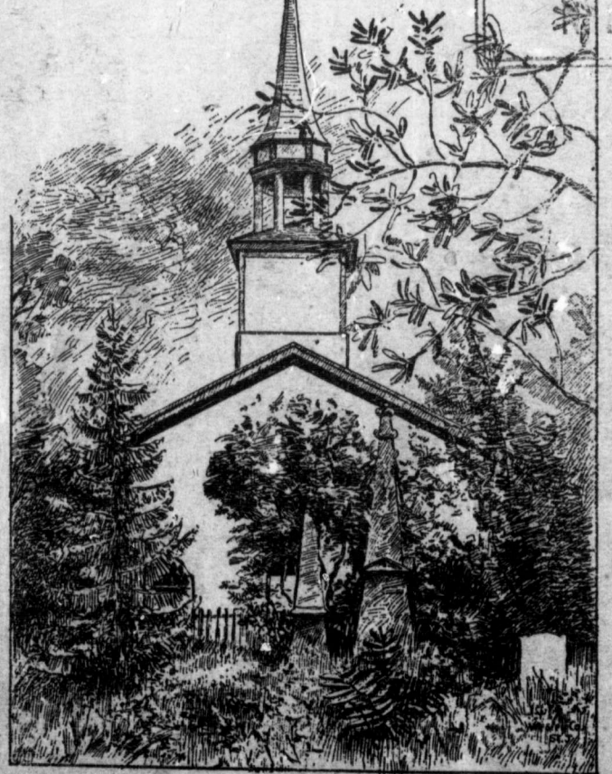
ST. PAUL'S CHURCH, OAK POINT, GREENWICH.