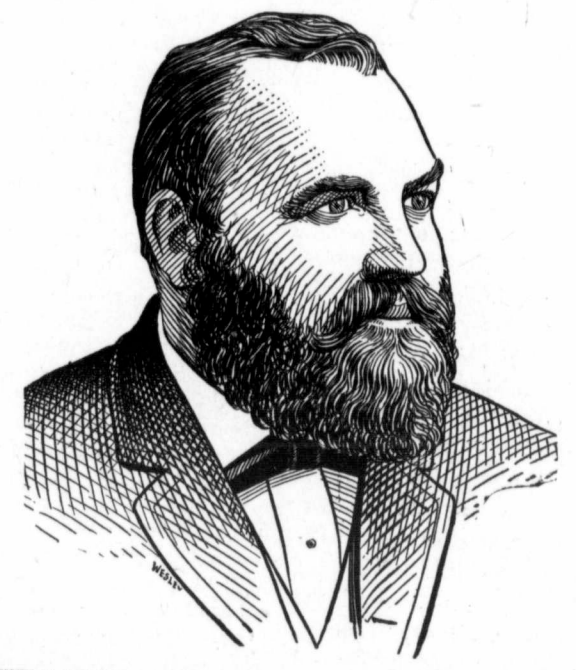
PROMINENT GANADIAN LAYMEN.