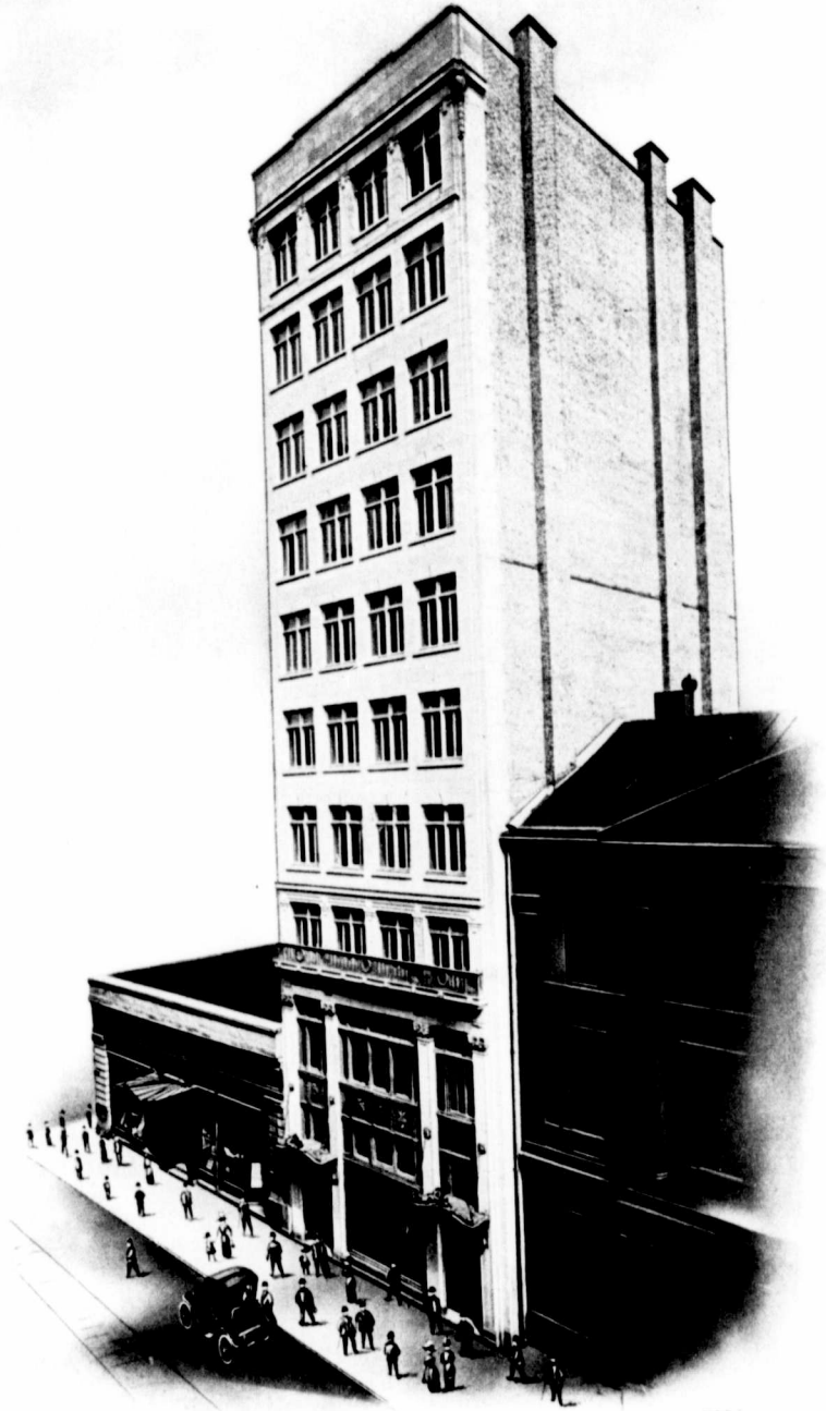
THE YORKSHIRE INSURANCE CO., LIMITED BUILDING RECENTLY ERIGED 136 & 138 ST. JAMES STREET, MONTREAL