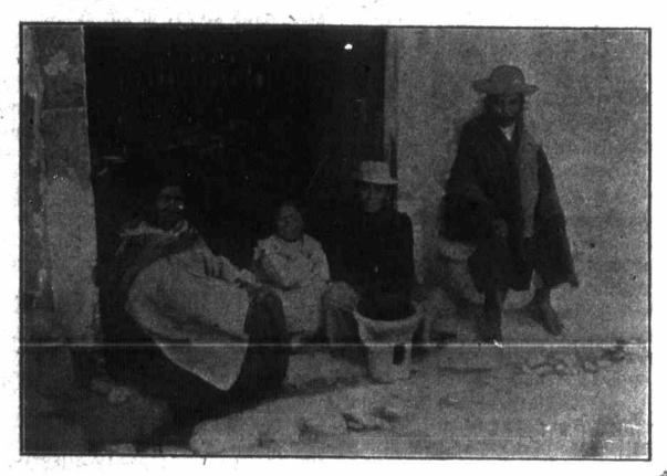
Native Shop, Bolivia.

Tarija, Santa Cruz and Trinidad, in four of which—Potosi La Paz, Oruro, Cochabamba—we have mission stations.