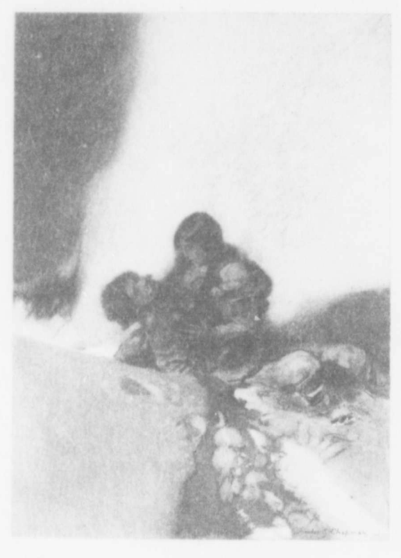
Parties he said feelby and fainted in her arms