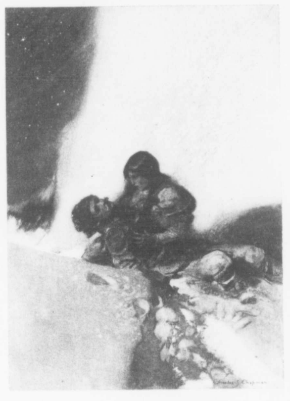
Rauline he said feelly and fainted in her arms