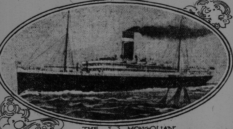
THE S.S. MONGOLIAN

St. John's, Nfld., May 25.—The ice blockade has again closed the port of St. John's, and five steamers were off Cape Race today unable to make the harbor. They were the Allan liner Siberian, from Philadelphia, the Furness liner Almer-