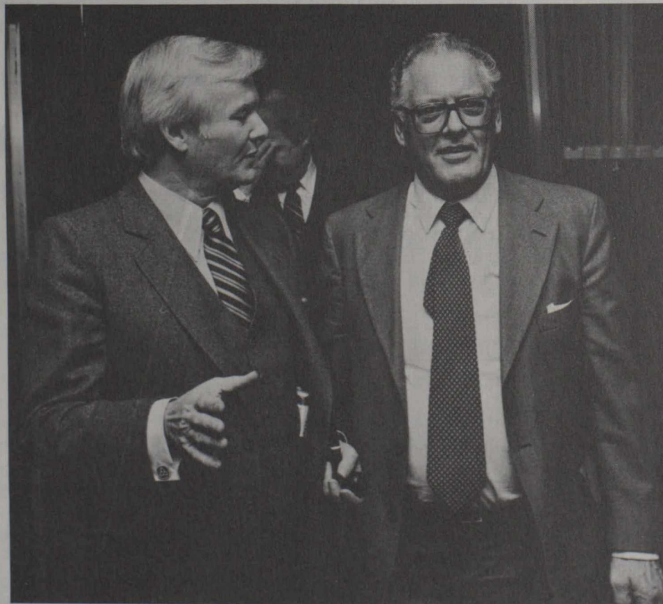
Le Vice-président Wilhelm Haferkamp accueille le Premier ministre de l'Ontario, l'Honorable William G. Davis lors de sa récente visite à Bruxelles, le 2 mars dernier.