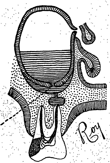
Fig. IV.-Maxillary empyema.

1. Examination of the Nose.—When making anterior rhinoscopy, we see pus coming from the middle meatus. In certain cases there are polypi. Posterior rhinoscopy oftentimes discloses pus coming from the choanæ and spreading on the velum palatum. Allow me to mention also Fränkel's sign, which consists of cleansing the patient's nose, and then to make him keep his head bent forward for a few minutes.