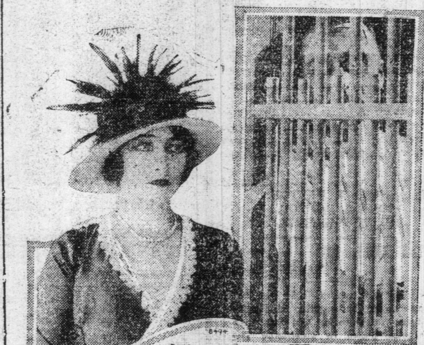
In heaven's name tell me the truth! PAULINE FREDERICK in "Out of the Shadow" The Famous Picture

Sold at Dwyer's Drug Store, St. Catharines