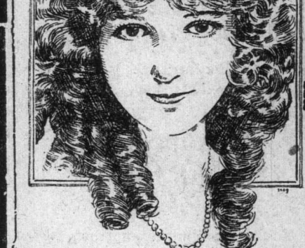
VIVIAN MARTIN in "Jane Goes A-wooing"