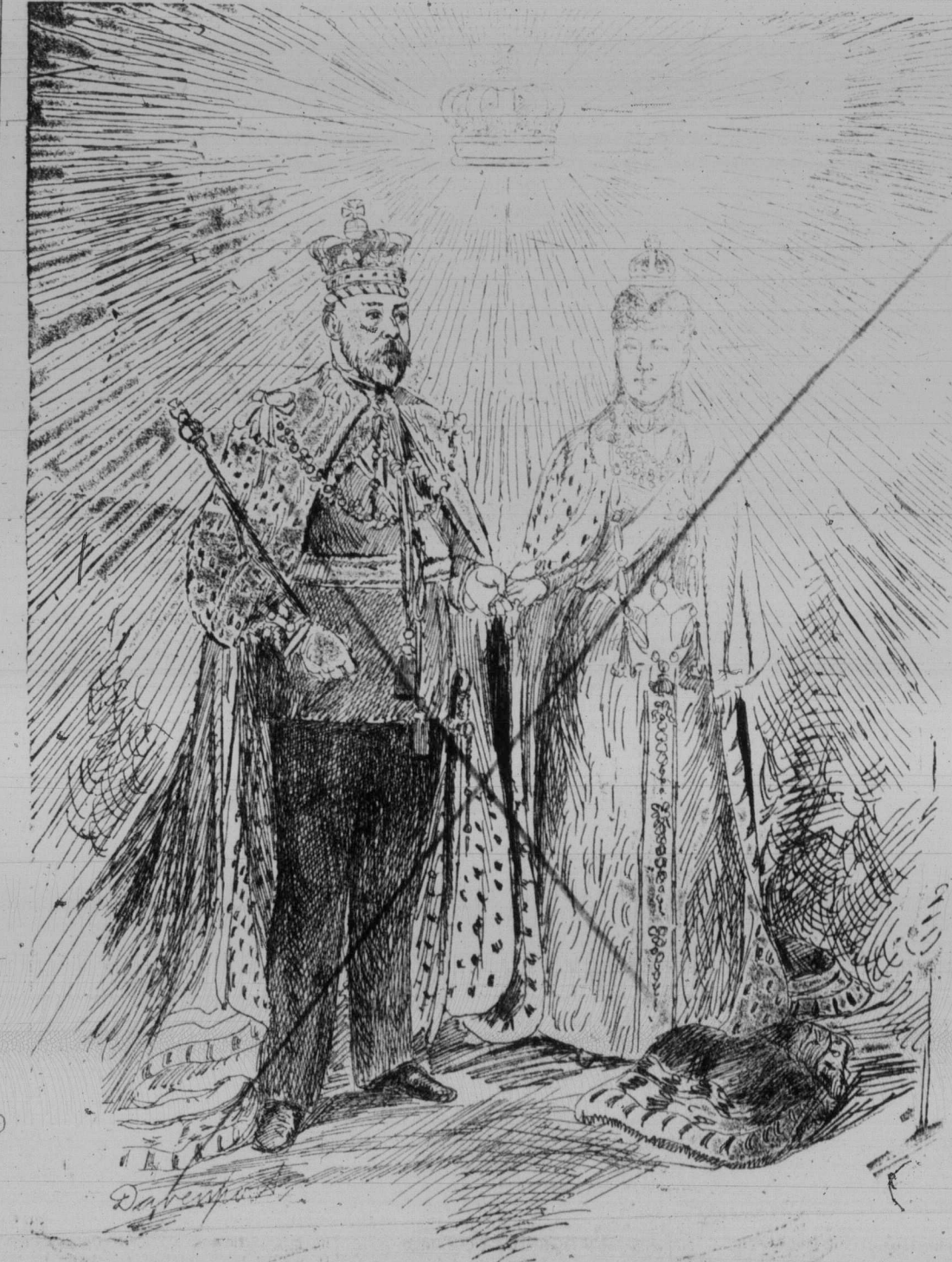
KING EDWARD VII AND QUEEN CONSORT.