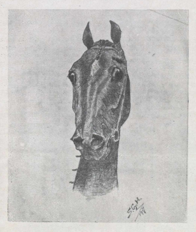
"Vibrant with feeling and courage Was his sensitive high-flung head."

The King's Plate claimed proof of his mettle. "Too fast and too far," they professed; But he bore the blood of great racers That knew not defeat from the best.