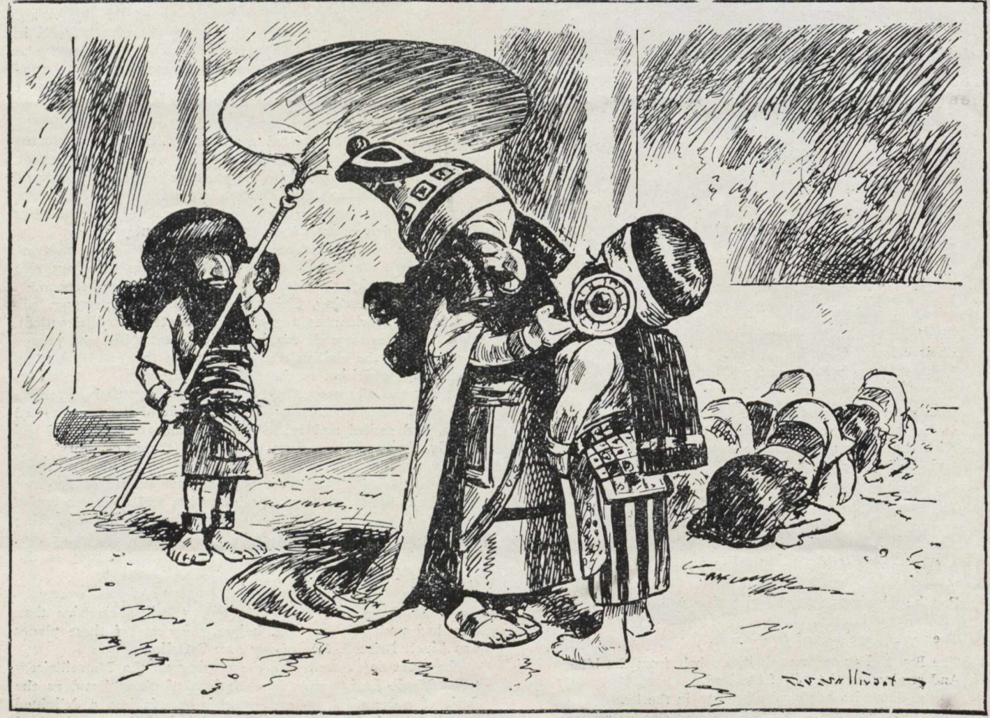
KING SOLOMON: "You're a cute little thing. Where do you live?" "I'm one of your Majesty's wives." "I thought your face looked familiar"—Life.

But when "O Canada" was played all recklessness fell from the tone and every eye saw but a vision of its own, and a minute later, with every man standing straight and steady as the most exacting Commander could desire, the band played "God Save the King."