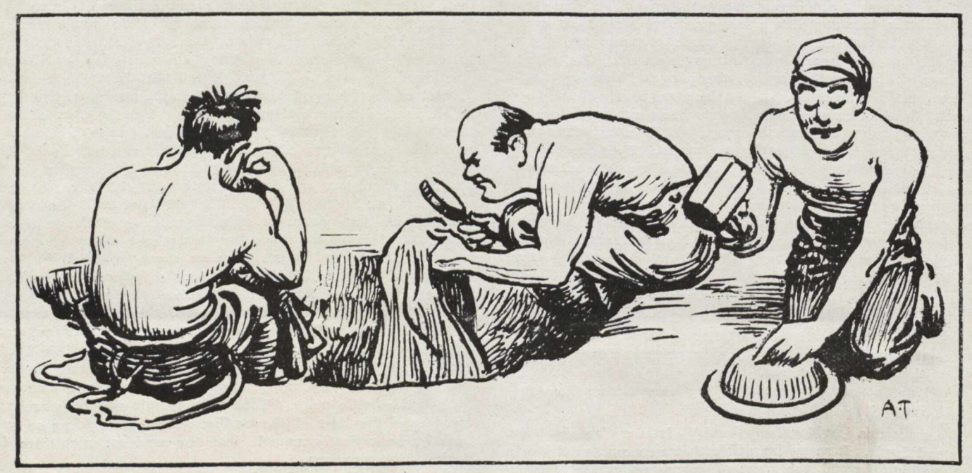
A picture similar to this in some Canadian paper is described as: "Canadians fresh back from the trenches, making urgent repairs to their clothes. They are experts with their housewives!" (Oh yes, quite so!)