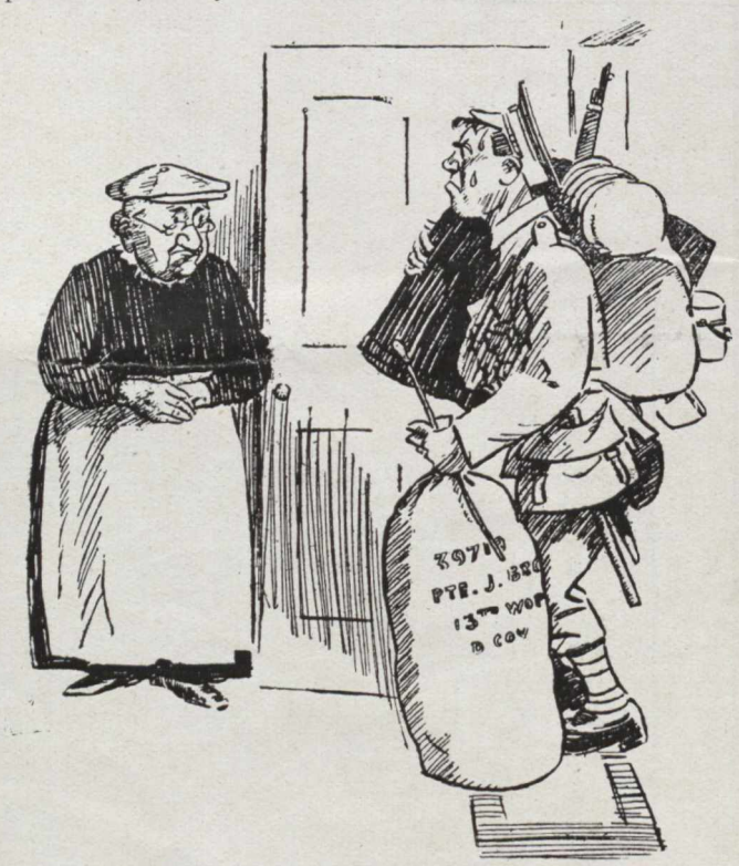
OLD LADY (taking a soldier in to billet for the first time); "Dearie me, what a load! Are you sure you came by all them things honest, my boy?"—London Opinion.

When the C.O. has silkily asked you if you will take his punishment, and you have coughed an affirmative.