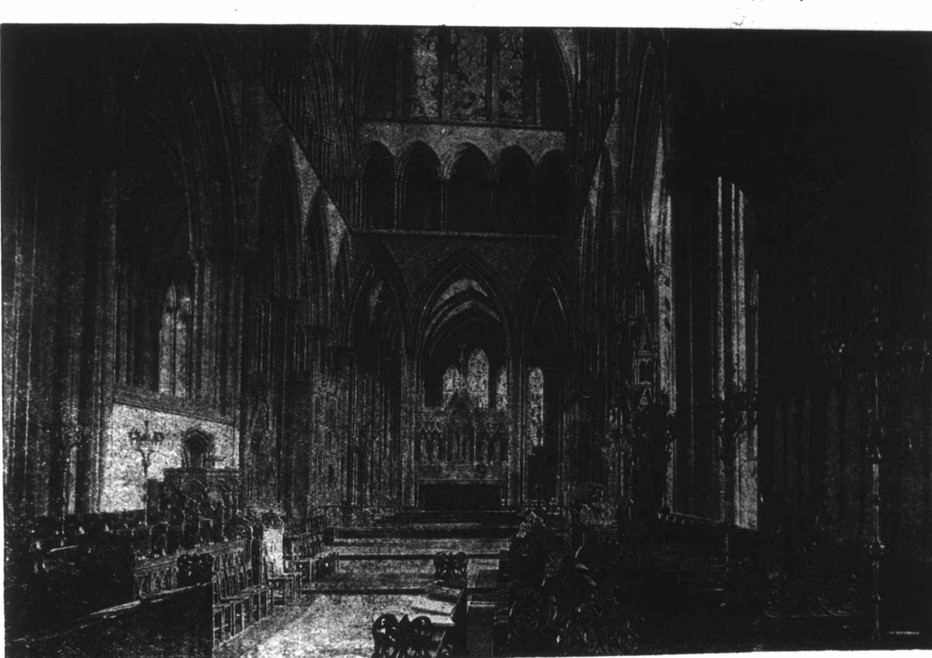
The Canadian Churchman.

"I know that my Redeemer liveth," from Job 19:25, 26, 27. "We brought nothing into the world—Blest be the name of the Lord.—I Timothy, 11:7.