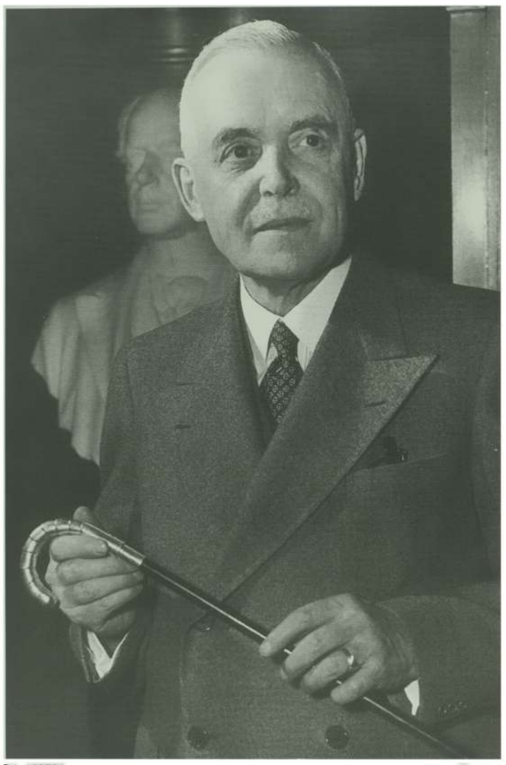
PA-182704 Prime Minister Louis S. St. Laurent.