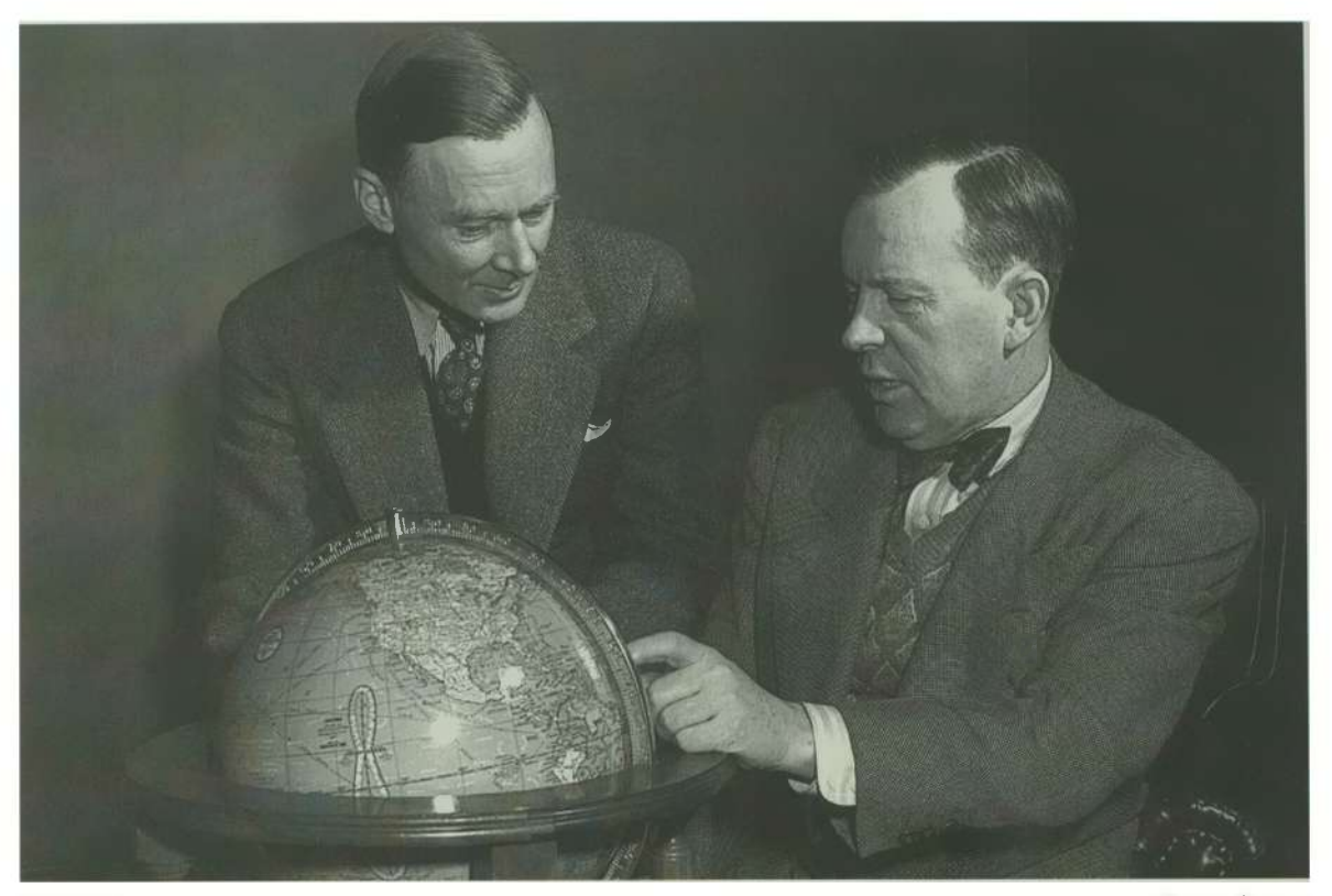
PA-121700 Deputy Under-Secretary of State for External Affairs Escott Reid

Deputy Under-Secretary of State for External Affairs Escott Reid and Secretary of State for External Affairs Lester B. Pearson, prior to departure for the Conference of Commonwealth Foreign Ministers in Colombo, Ceylon (now Sri Lanka).