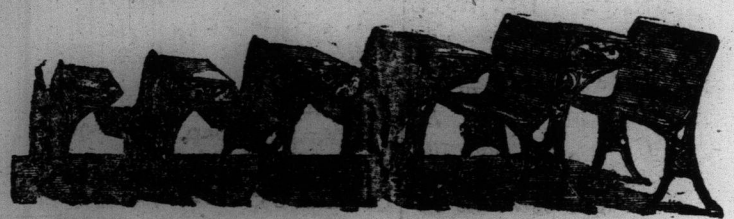
VIEW OF ROW OF PARAGON DESKS IN POSITION.

This illustration shows Double Desks with Double Seats, each accommodating two pupils. Double Desks can also be supplied with Individual Seats, each seat rising independent.