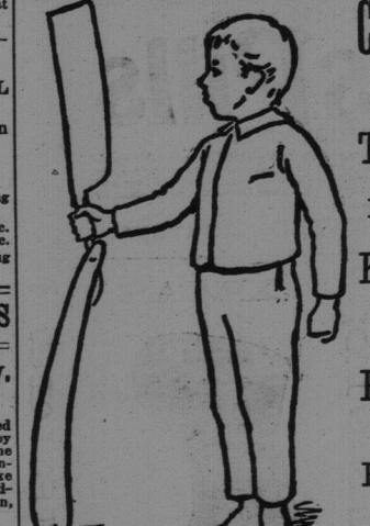
TABLE CUTLERY —with— Ivory, Plated and Celluloid Handles. KNIVES AND FORKS AT ALL PRICES.

PRICES FOR HOLIDAY TRADE. EROOMS 54 KING STREET.