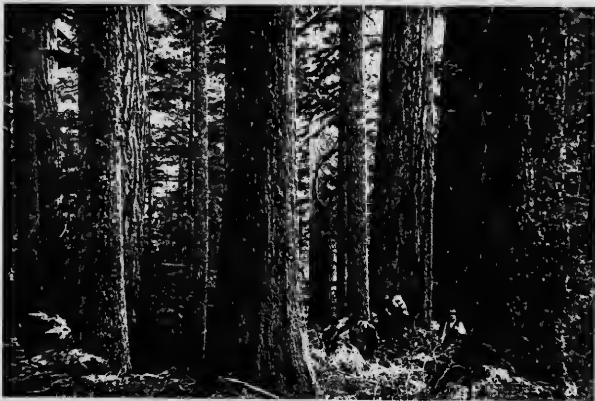
THE FOREST WEALTH OF BRITISH COLUMBIA.