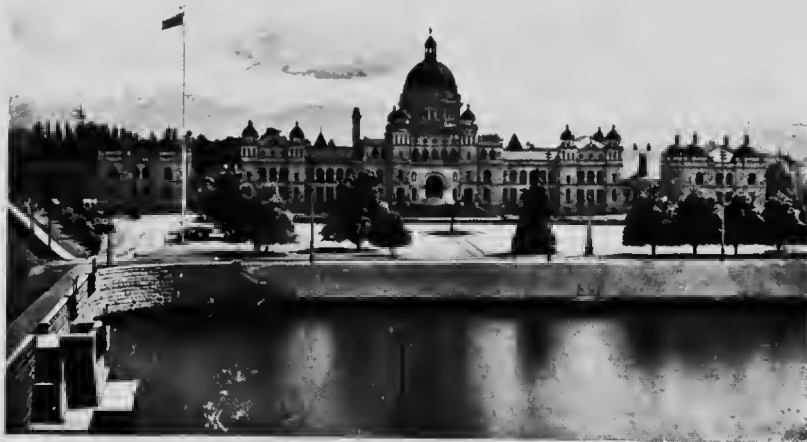
SOUVENIR Of visit of Pacific Northwest Library Association. SEPT. 4-6, 1911.