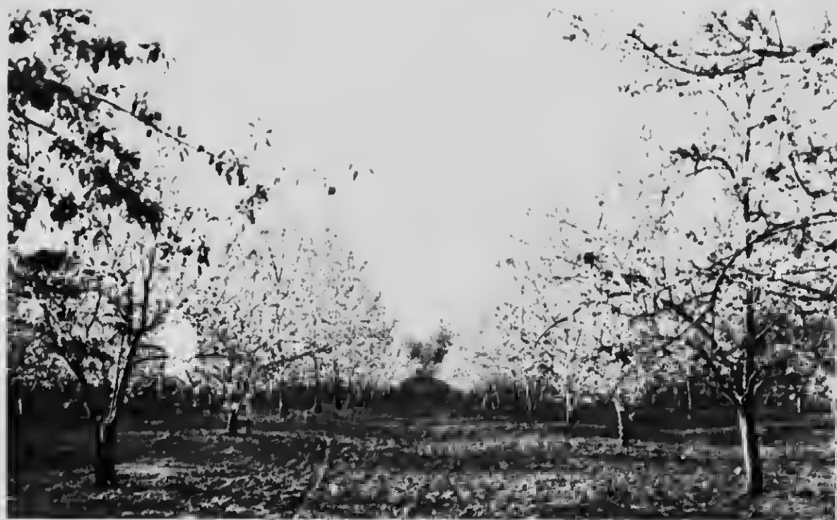
A BRITISH COLI MATA ORCHARD IN BLOOM.