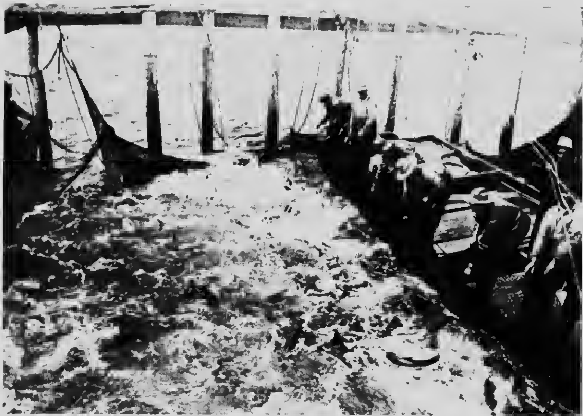
RAISING A TRAPNET.