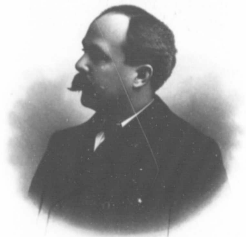
The Honorable Charles Saylor