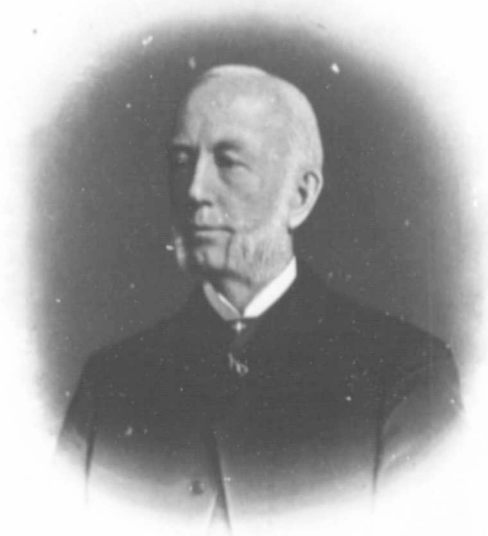
The Honorable John Quincy Adams