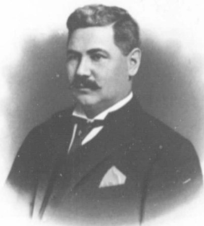
The Standard Photo Engraving