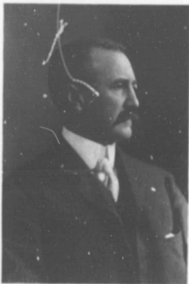
The Christian-Post, Syracuse