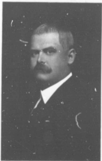
The Canadian Press Agency