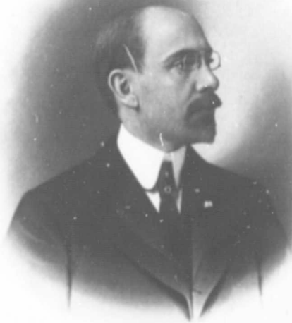
The Christian Union, September 1890