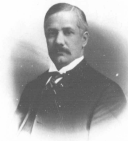
The Chamberlain Photo Studio