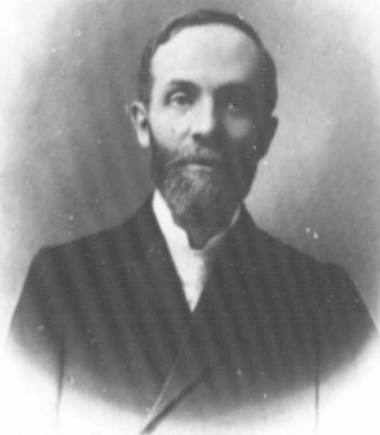
The Governor, Peter B. Ketchum