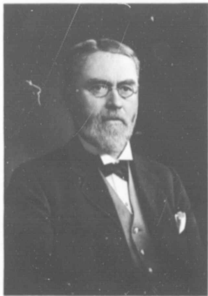
The Canadian Press, Kingston