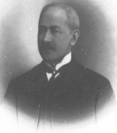
The Christian Photo Studio