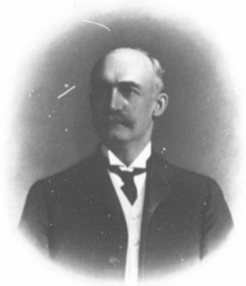
The Chamberlain Photo Engraving