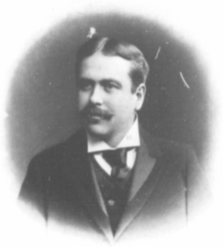
The Standard Photo Company