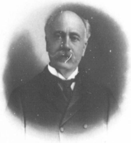
The Chairman, New York