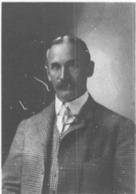
The Canadian Photo Engraving Co.