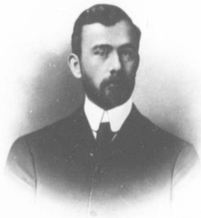
The Liberator's Photo Studio