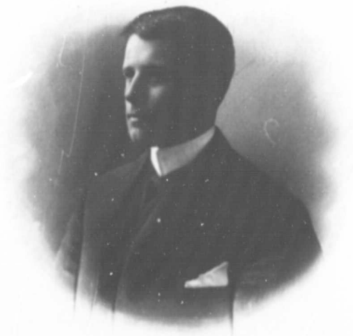
The Canadian Press Syndicate