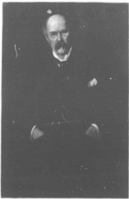
The Canadian Press Archives