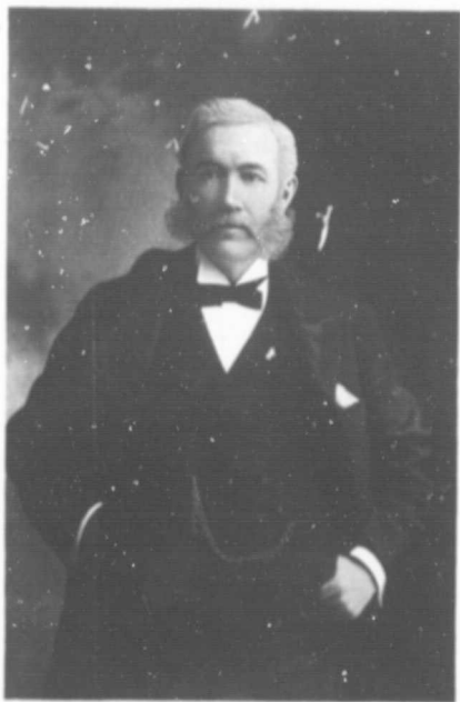
The Standard Photo Studio