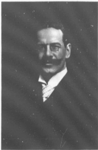
The Standard Photo Company