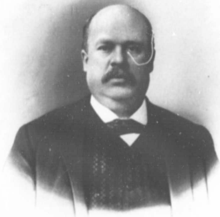
The Standard Photo Engraving