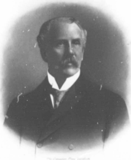
The Standard Photo Engraving