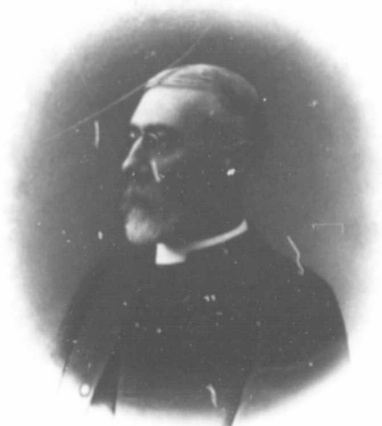
The Christian Union