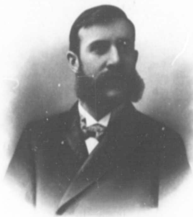
The Standard Photo Engraving Co.