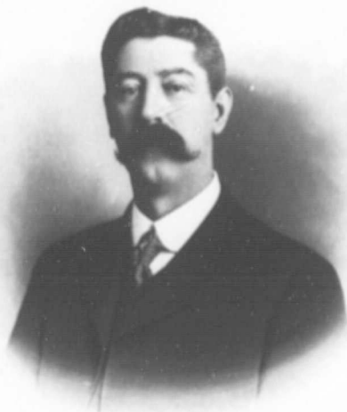
The Standard Photo Company