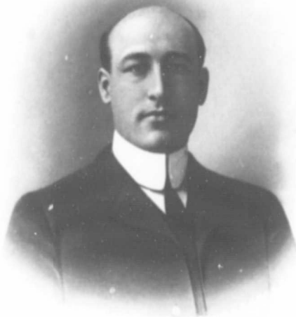
The Executive of the Organization