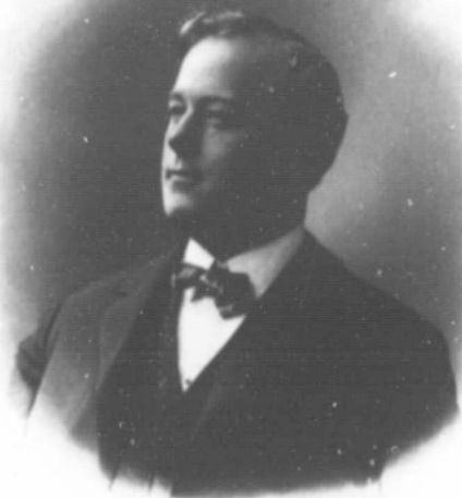
The Candidate of Free Speech