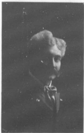
The Cleveland Press Syndicate