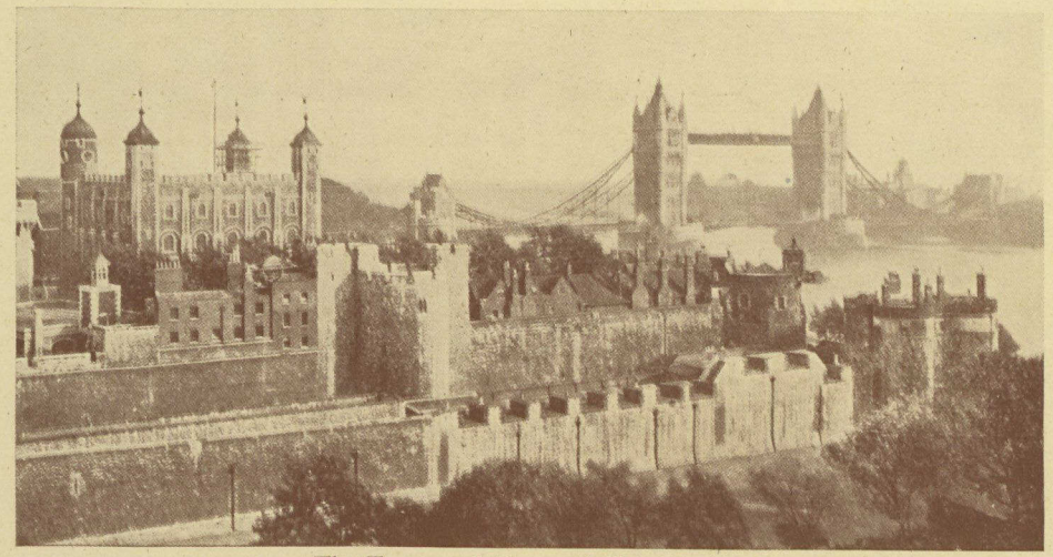
The Tower and Tower Bridge, London.

"It is a matter for congratulation for all of us that through the medium of this Home we have been able to be so helpful to so many of our sick and disabled Canadian soldiers, who would otherwise have been cared for amongst comparative strangers.