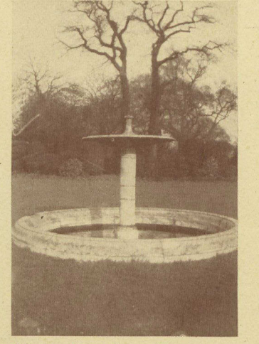
Marble Fountain at Kingswood. From Royal Palace of St. Cloud, France.

The beautifully painted frieze in the Entrance Hall, the ceiling of the Dining Hall and the tapestries in the Recreation Hall and Billiard Room, are other interesting art treasures in this notable collection.