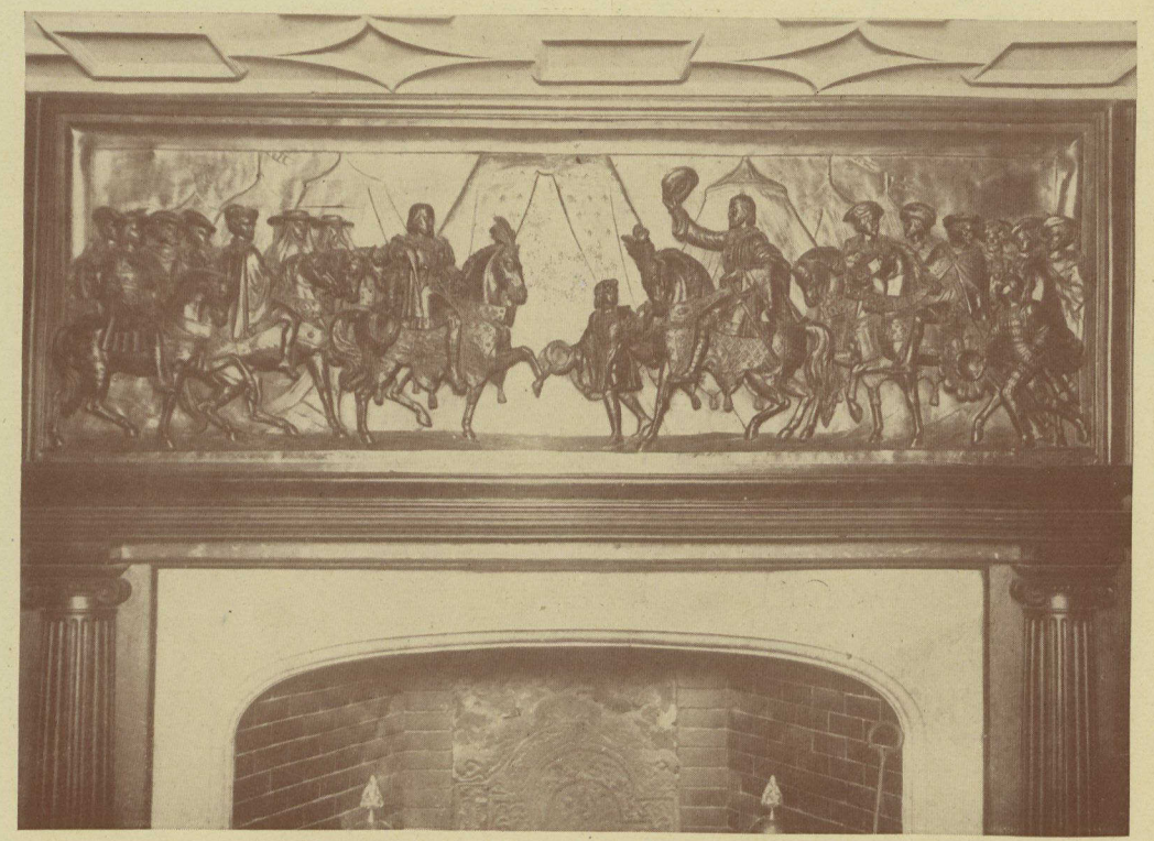
Bronze Tablet "The Field of The Cloth of Gold" Fire Place in Recreation Hall.