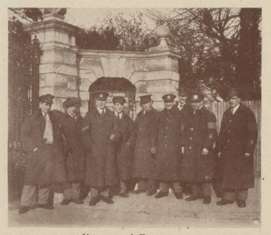
Kingswood Entrance. A happy group going out for their afternoon's walk.

the matters of the discipline of the patients and their medical examination, classifying and consequent disposal. In these matters we work under the Canadian Convalescent Hospital at Bromley, Kent, about five miles distant. That hospital acts as a clearing station for convalescent Canadians in the South London area, and all our patients reach us and are discharged from Bromley. One of the medical staff at Bromley acts as M.O. for Kingswood, and pays a visit daily to the men here, or oftener if required. We also have periodic visits of medical and surgical specialists to consult with the medical officer on any difficult cases, and there are also weekly examinations of the men by a Travelling Medical Board, who classify the men and decide as to their disposal at the end of their stay here. There are in France a number of Canadian Field and Base Hospitals for the treatment of the slightly wounded and giving first aid to the more seriously wounded, and there are also in England a number of Canadian hospitals for the treatment of men who fall sick in the Canadian training camps in this country. But almost all the seriously wounded Canadian soldiers from France are sent to the British "active treatment" hospitals in England or Scotland. The large Ontario Military Hospital at Orpington, near London, is almost the only purely Canadian "Active Treatment" Hospital receiving wounded men direct from! France. In the British "Active Treatment" Hospitals,