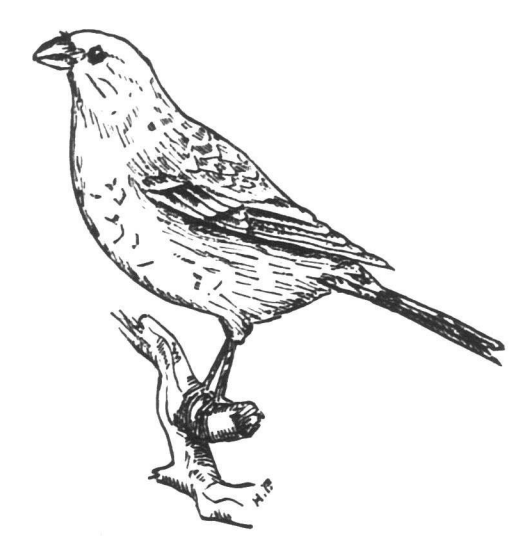
PINICOLA ENUCLEATOR CANADENSIS (515, A. O. U.)-1/8 Natural Size.

Do you ever think what wondrous beings these? Do you never think who made them and who taught The dialect they speak, where melodies Alone are the interpreters of thought? Whose household words are songs in many keys, Sweeter than instrument of man e'er taught.