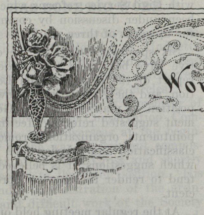
The February Meeting.