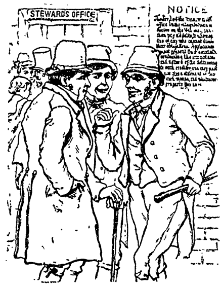
THE NOBLEMAN'S OFFER.