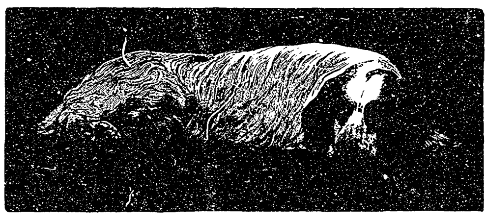
The Clumber Spaniel Dog, CHAMPION JOHNNY.