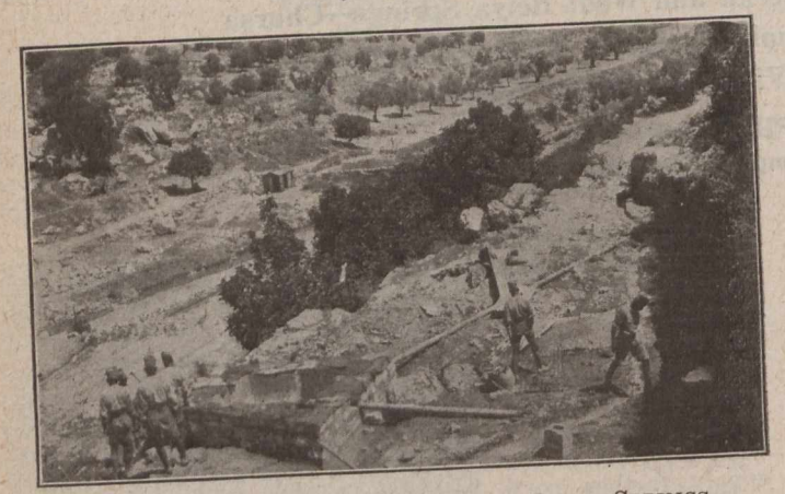
INTAKE, AIN ED DILBE AND WADI REIYA SPRINGS WATER SUPPLY

Accordingly, it was decided to utilize Ain Zerka as a supply for practically the whole division, the water to be delivered to the high ground in the rear areas where the transport lines were situated. Levels were taken and it was