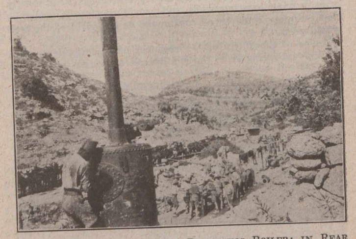
AIN ZERKA—IN FOREGROUND, DELOUSING BOILER; IN REAR, AT LEFT, TROUGHS FOR MULES; AT RIGHT, WASH TABLES FOR TROOPS

Alongside the plunge pool was a row of twelve shower baths, having a concrete floor, the water being supplied