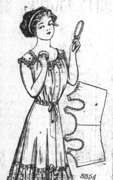
Ladies' Corset Cover and Skirt.

The simplicity as well as the practical features of this model will readily appeal to the home dressmaker. Lawn, dimity, nainsook, percale or china silk may be used, with lace embroidery for decoration. The Pattern is cut in 3 sizes: Small, Medium and Large. It requires 3 1/2 yards of 36 inch material for the Medium size. A pattern of this illustration mailed to any address on receipt of 10c. in silver or stamps.