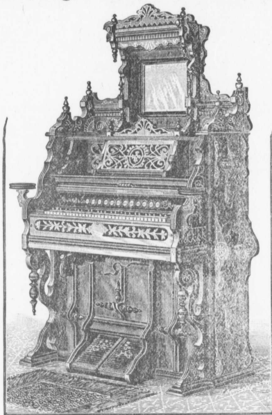
Mirror-top Organ-Style 552.

Before purchasing elsewhere it will pay you to correspond with us. Large illustrated catalogue free upon application , with description of over fifty styles of Organs manufactured by us for PARLOR, CHURCH OR HALL . Special discount to Ministers, Churches and Fraternal Societies.