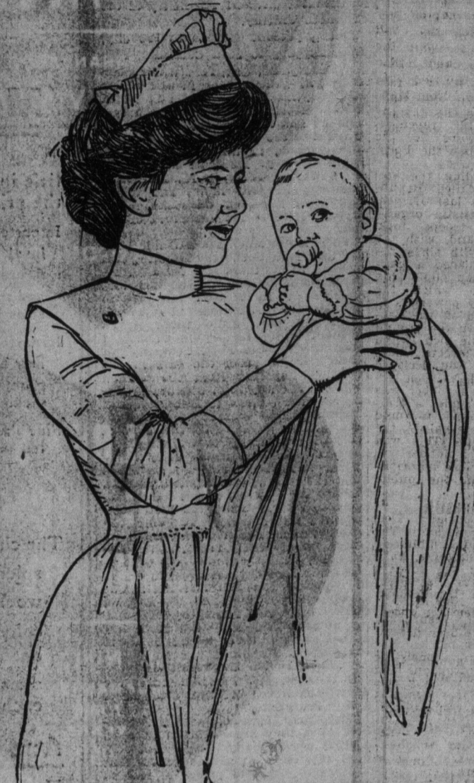
A Pen Sketch of an Everyday Incident.