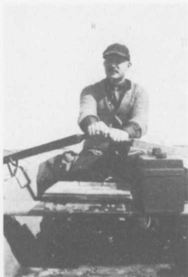
D.R. on his way to the "Cathedral."

Three or four drops of "Angostura" bitters on a lump of sugar, in a tumbler, add a half wineglass of London Dry Gin, or "Square Face," twice as much plain soda or cold water and small piece of lemon rind.