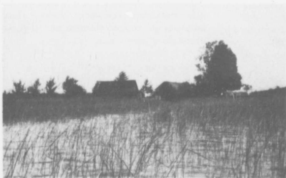
The Club property from the bay.

PREPARATION: Run the steak through the meat chopper, also the raw onions; parboil the onions in frying pan with a little water; add the chopped meat, season to taste and simmer 20 minutes. Serve with fresh made toast, Worcester sauce or tomato catsup—and boiled potatoes, of course.