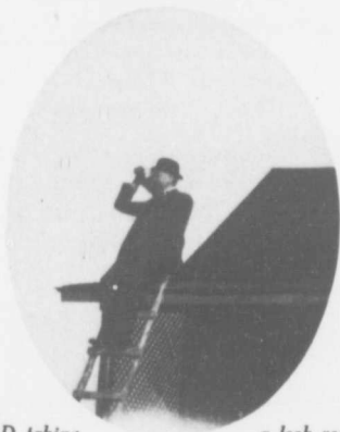
A.J.D. taking a look round "Hurry up! I see a bunch near the rush bed—Dash!!"

PREPARATION: Take the finnan haddie, trim off tail and fins, wipe with moist cloth and cut into four or five pieces. Place in baking pan and cover with warm water and put on fire until the water comes to a boil, drain off the water and place lump of fresh butter on each piece of fish, season with pepper and place in oven to bake for a few minutes.