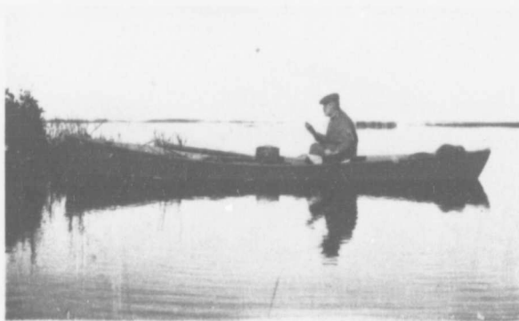
It's me—The Chef. Going into No. 1 Blind.