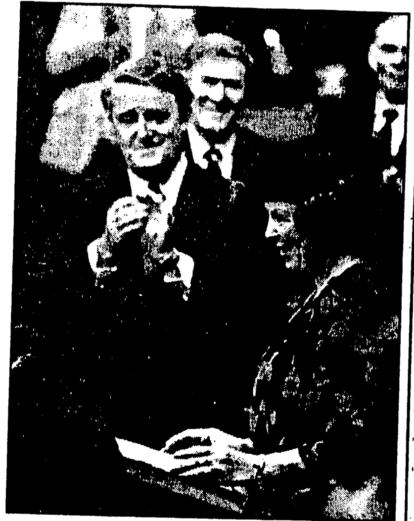
La reine Béatrix des Pays-Bas s'est adressée hier aux députés et sénateurs à Ottawa

En lui souhaitant la bienvenue, le premier ministre Brian Mulroney avait de son côté rappelé l'époque où la reine et sa soeur vivaient en exil à Ottawa avec leur mère, la reine Juliana.