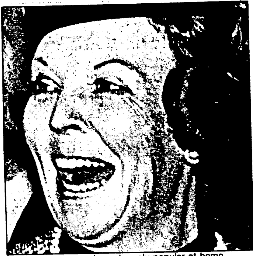
Queen Beatrix remains extremely popular at home