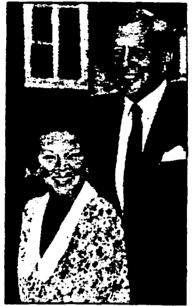
Holland's Queen Beatrix and her husband, Prince Claus, arrive in Ottawa on Monday to start a nine-day, nine-city visit. The tour marks a special bilateral relationship dating from World War II, when the Dutch royal family took refuge in Canada. The Canadian Army played a major role in liberating Holland.

The communications and computer business has lured a few Canadian companies to Holland for better access to both Dutch and other European markets. They include Northern Telecom, Mitel, Gandalf Technologies Inc., Geac Computers, Xios Systems, (formerly AES), and Cognos Ltd.