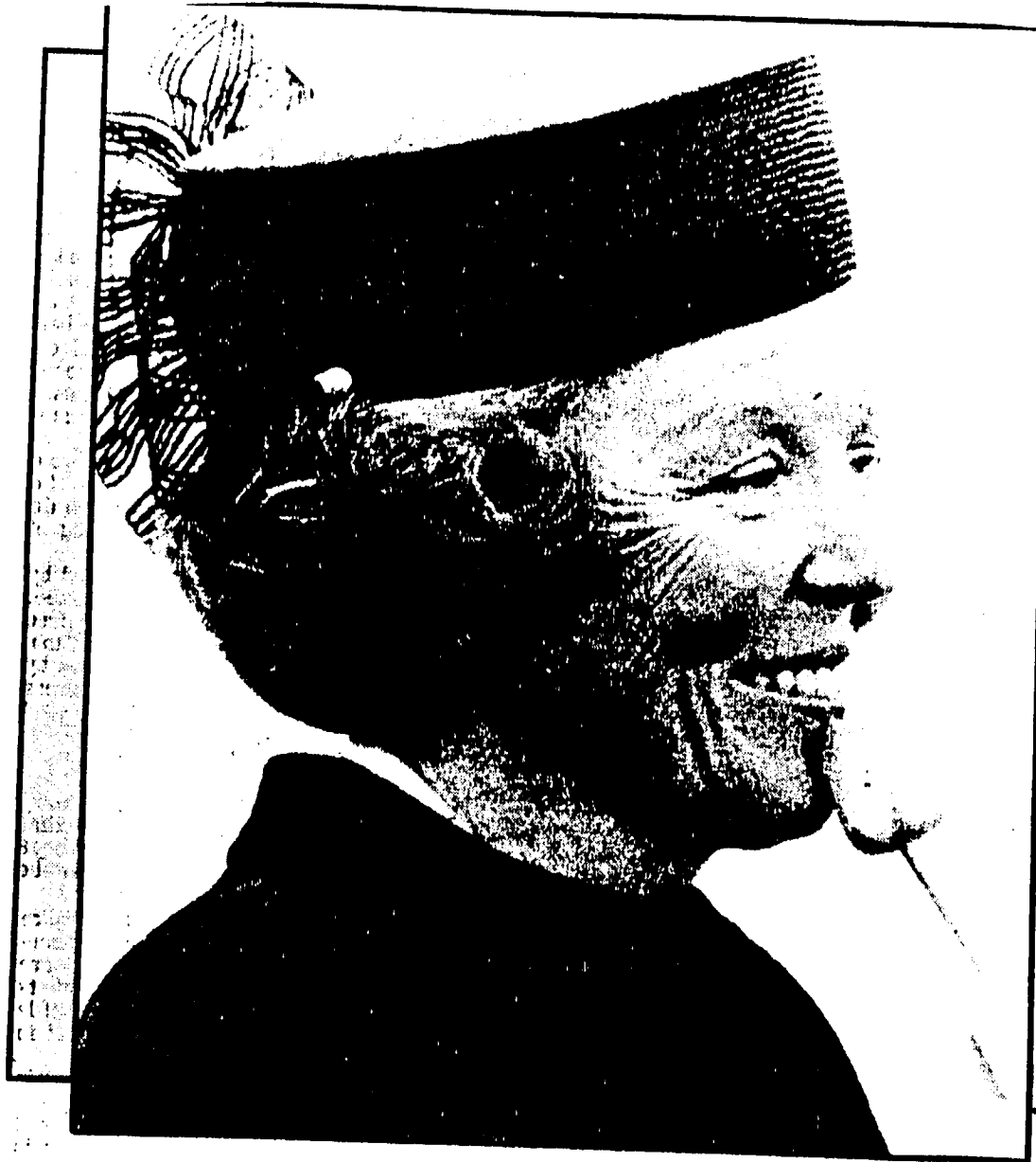
QUEEN BEATRIX stops to smell a tulip during her arrival tour yesterday.