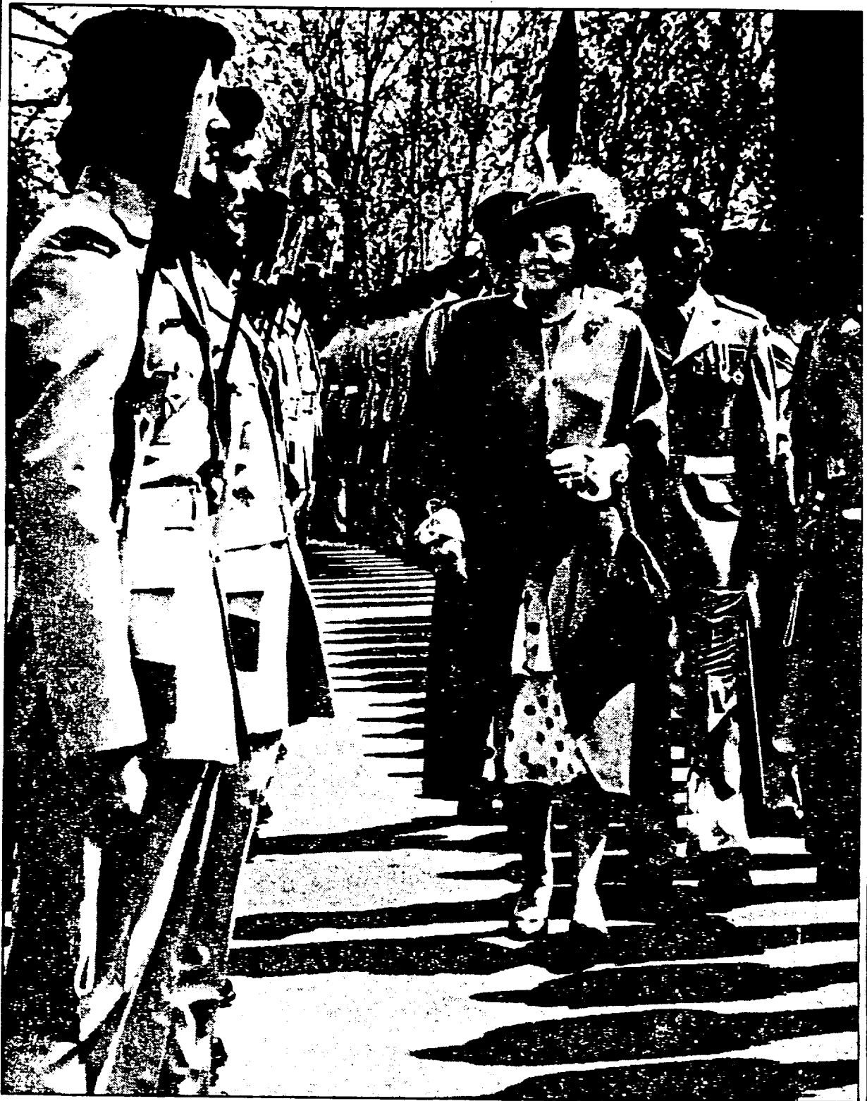
Queen Beatrix inspects the First Canadian Signal Regiment