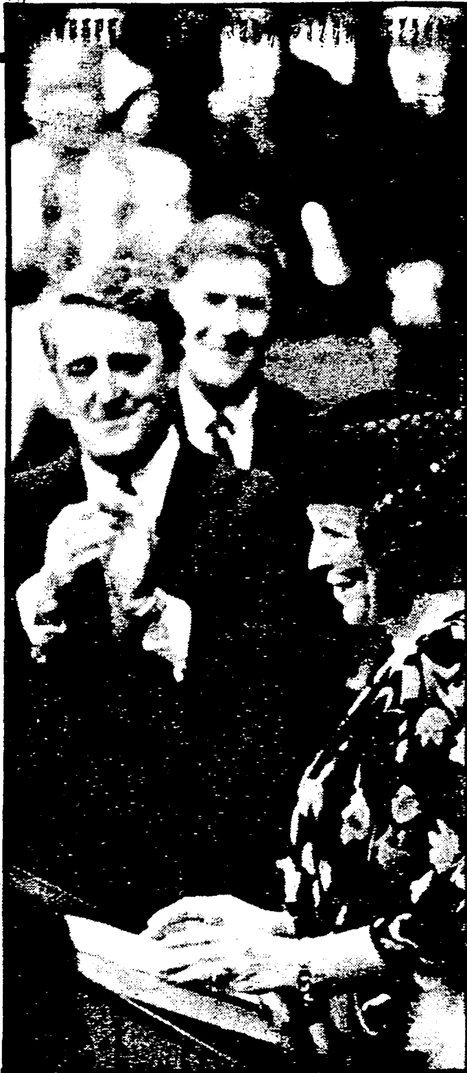
PRIME MINISTER Brian Mulroney applauds Queen Beatrix, speaking in the Commons yesterday as part of a nine-day state visit.

"But the report is a very touchy thing for Quebecers. It did suggest that we should all be assimilated to the English."