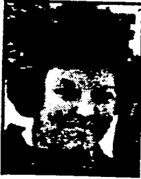
Queen Beatrix Sparked fuss

QUEBEC — The Dutch foreign minister said Wednesday that Queen Beatrix of the Netherlands was misunderstood when she praised the historic Durham Report and that he "regrets" the confusion which prompted Quebec politicians to demand a clarification of her remarks. The 1839 report by Lord Durham suggested that French-speaking Quebecers should be assimilated into the English majority and had little culture of their own. Queen Beatrix praised the Durham Report in the context of the evolution of parliamentary government in Canada, which the report recommended be established, when she addressed MPs, senators and invited guests in Ottawa on Tuesday, said Dutch Foreign Minister Hans Van Den Broek. But Parti Québécois members of the Quebec legislature boycotted the queen's visit because of the remark and asked for a "clarification" from the Dutch government.