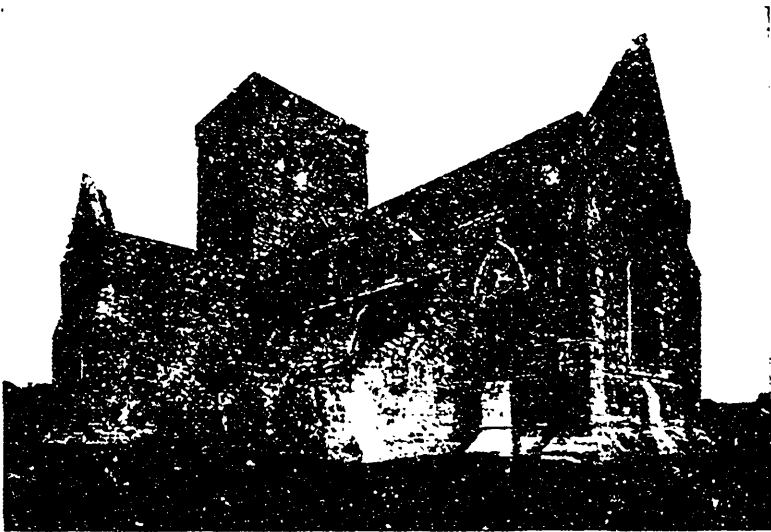
CATHEDRAL OR CHURCH OF ST. MARY'S, IONA.