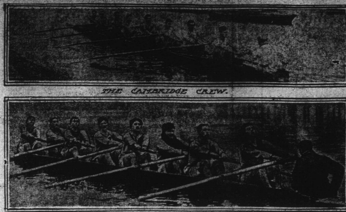
The Oxford-Cambridge Boat Race Pictures will be put on as an "Extra" (by special request) at the Starland Theater today

Answering the amendment to exclude speculators from the benefits of the extension of time, the minister said that the foundation principle of the act in first passed, and to the substitute or buyer of scrip on an equal footing with the original holder in order that the original holder might benefit by getting the highest value for his scrip. Purchasers bought in the belief that this principle having been affirmed by parliament, would be adhered to and this belief was further warranted by the action of parliament in dealing with the scrip of 1885, which had been given several extensions of time.