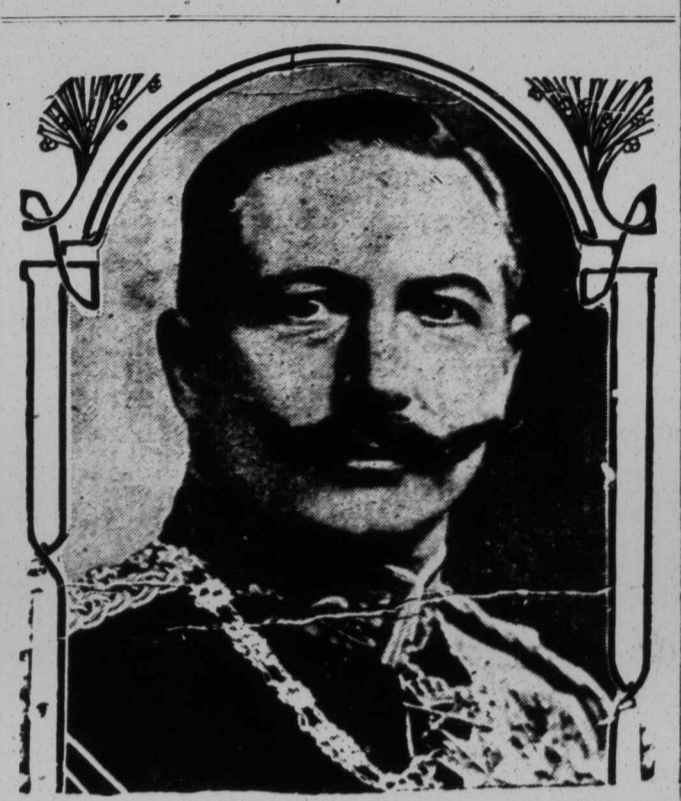
EMPEROR WILLIAM II. of Germany

Last Monday the people of Germany celebrated the twenty-fifth anniversary of the Emperor William's accession to the throne. Great preparations were made for it and for that day Berlin was the centre of the world's attention.