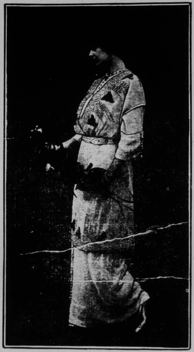
An Effective Trimming of Wool Embroidery