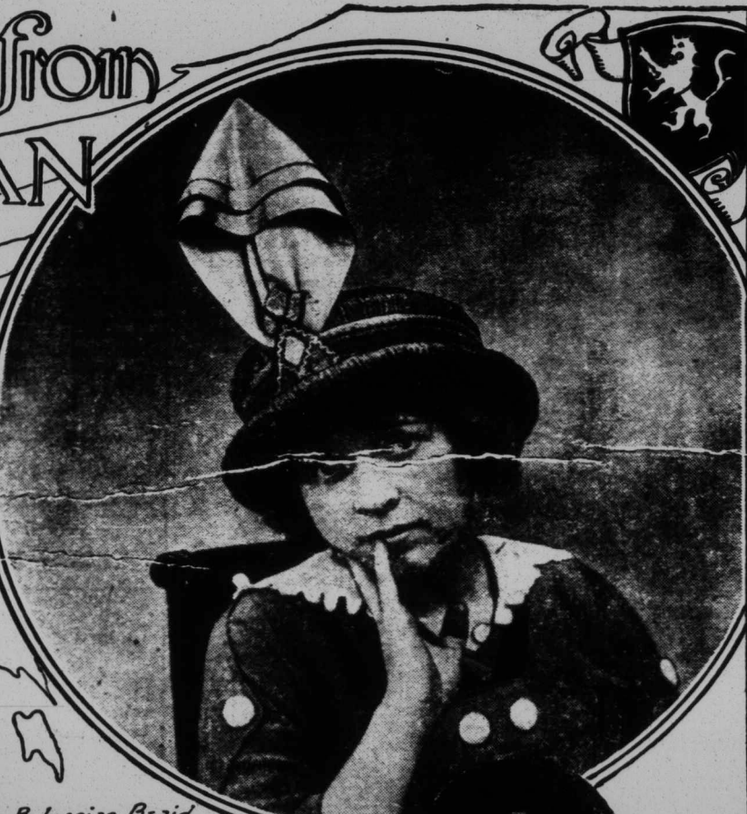
Bulgarian Braid Holds the Red Wing

Perhaps to many minds the vicissitudes of war and the changing of maps are still unknown. One thing is certain: Bulgaria is a very important country in fashionland and has gained a decided victory over feminine hearts and wardrobes.