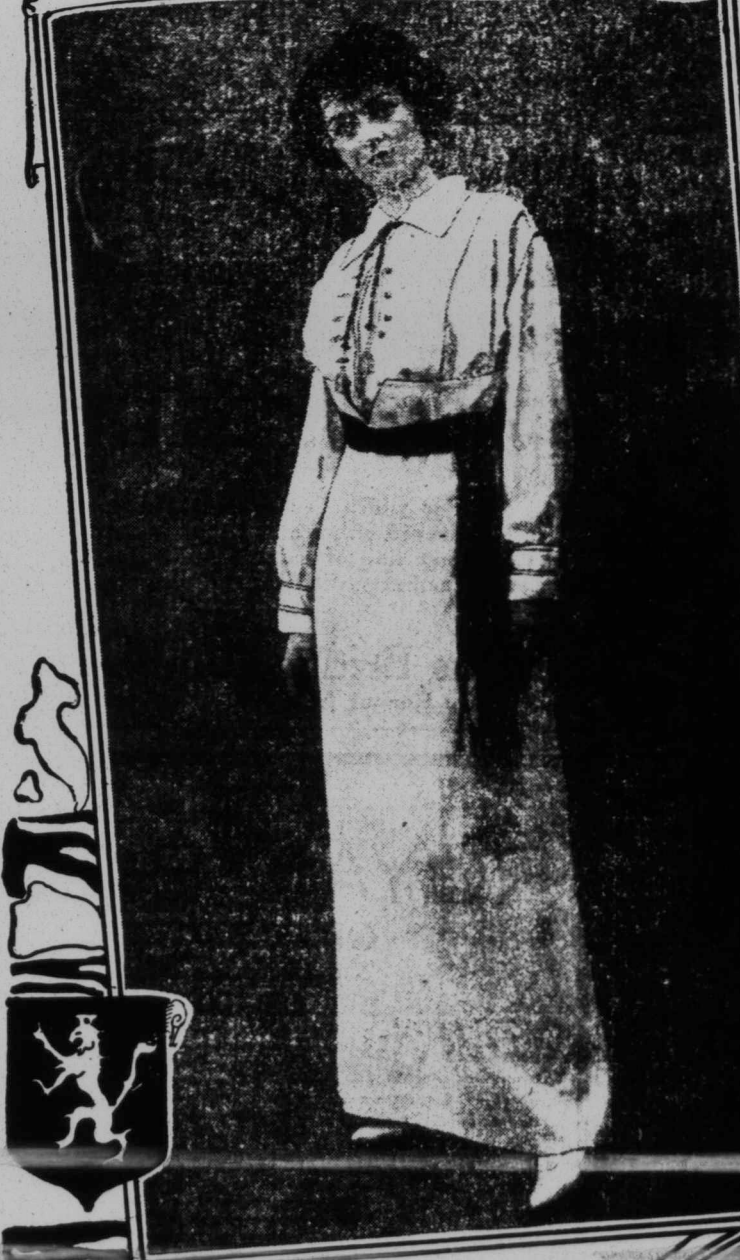
The Scarlet Crepe Sash is Strong

SINCE the trouble in the Balkan states, and the prominence which Bulgaria has had in history of the day, it is not surprising to note the emphasis that designers have placed on dress ideas that are characteristic of the people of that country. The colors, embroidery, general peasant lines and odd ornaments have been seized by the arbiters of fashion and made to furnish a new chapter in the long story of styles. Bulgarian fashions have come by way of Paris to stay for a few seasons. So make your choice, madame, and rejoice in an unexpected turn of fashion's wheel.