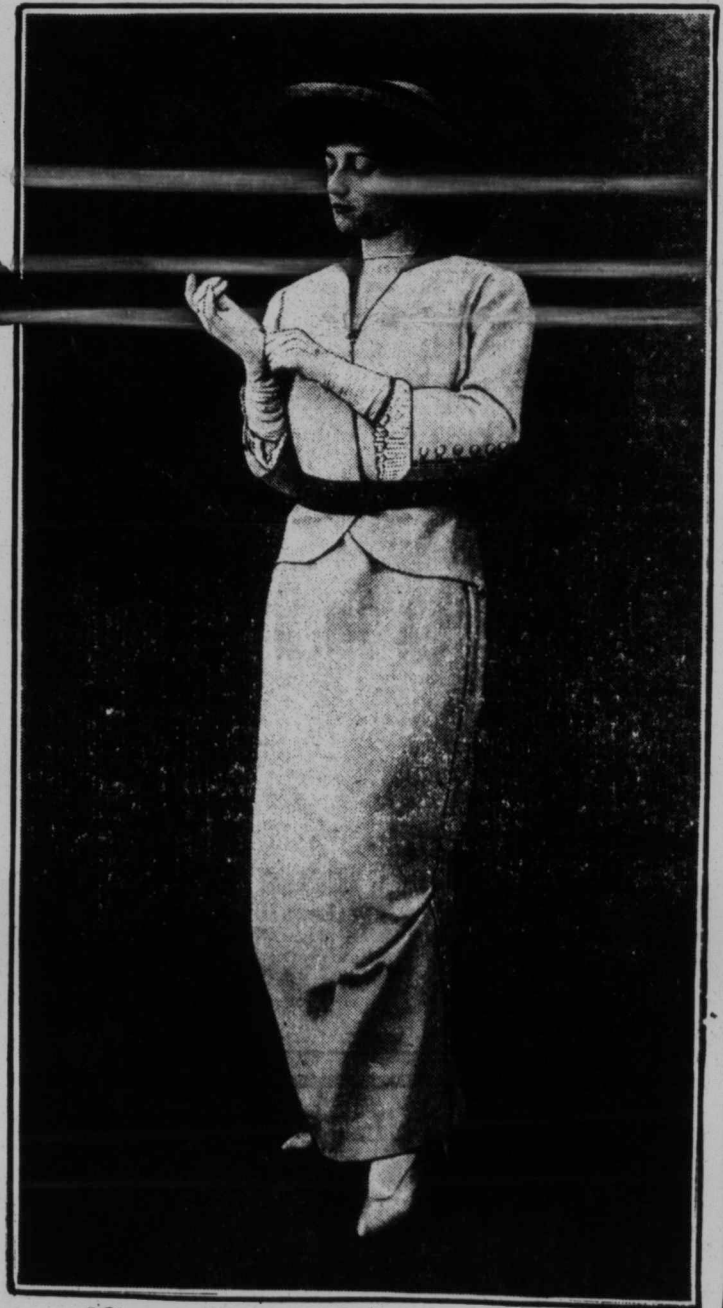
A Blouse Coat With Bright Colors