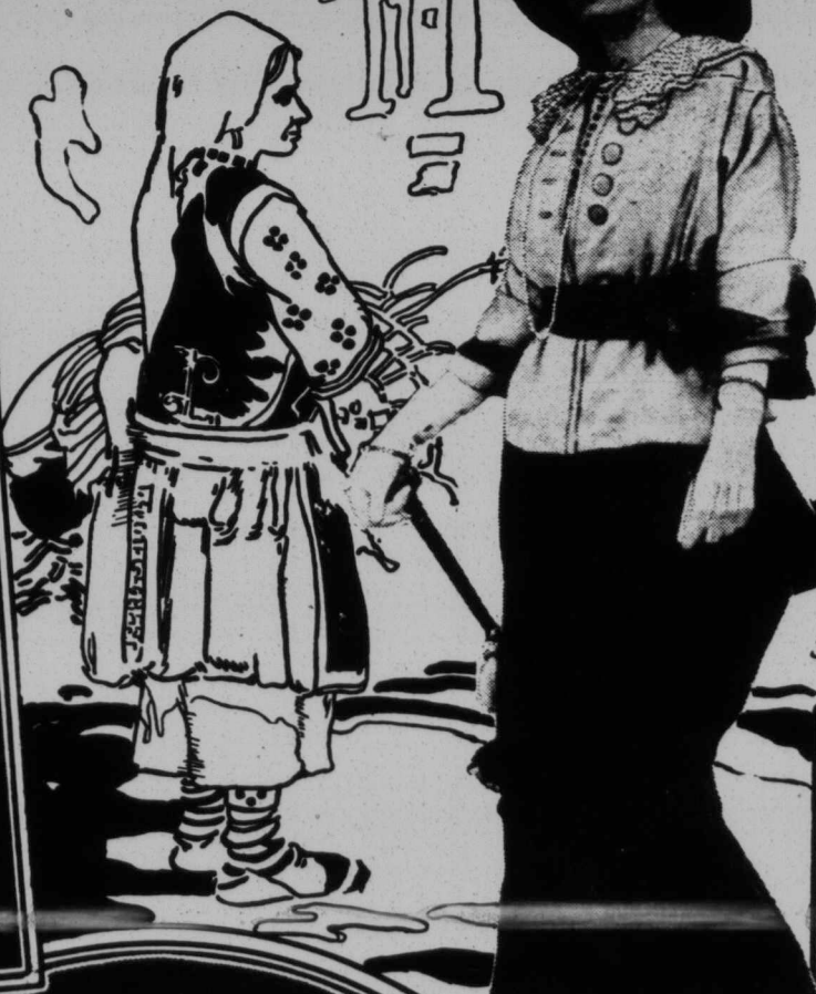
Coats are of Contrasting Colors