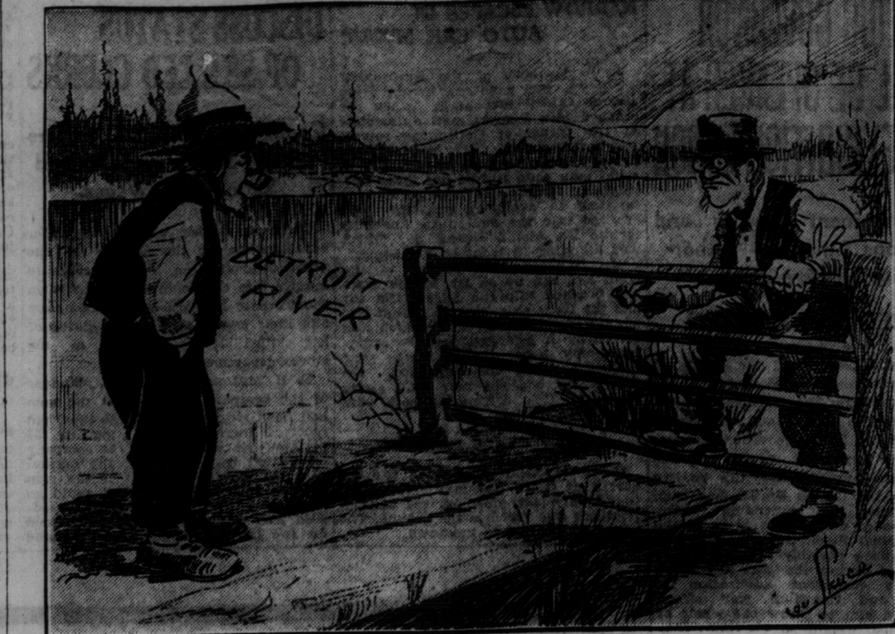
Farmer Briebois: I heard their guns shootin' and th' women hollerin' when they was raidin' yure cellar lae' nit, John.

BUY LOTS NOW before they advance in price, and start building for occupation next winter. Beautiful Residential Property. Nearest Restricted District to the Centre of the City. West Side of Bathurst St., North of St. Clair Ave. CEDARVALE.