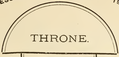
DIAGRAM OF THE SENATE CHAMBER. 3RD SESSION, 9TH PARLIAMENT, 1903.

Speaker: HON. LAWRENCE G. POWER, Halifax.