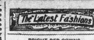
THE LATEST FASHIONS