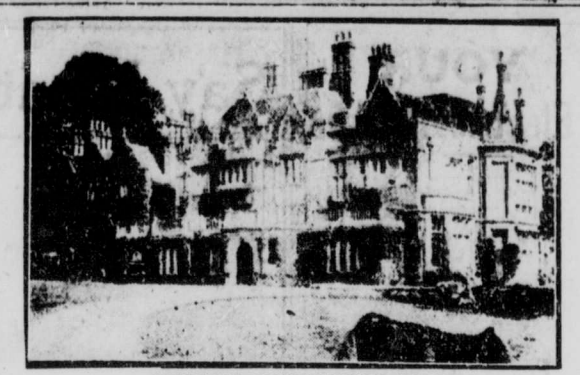
FLORENCE NIGHT INGALE'S HOME.

A total of $6,047,010.12 in surplus stores was disposed of by the various Government departments through the War Purchasing Commission between December 1st, 1918, and Masch 31st,