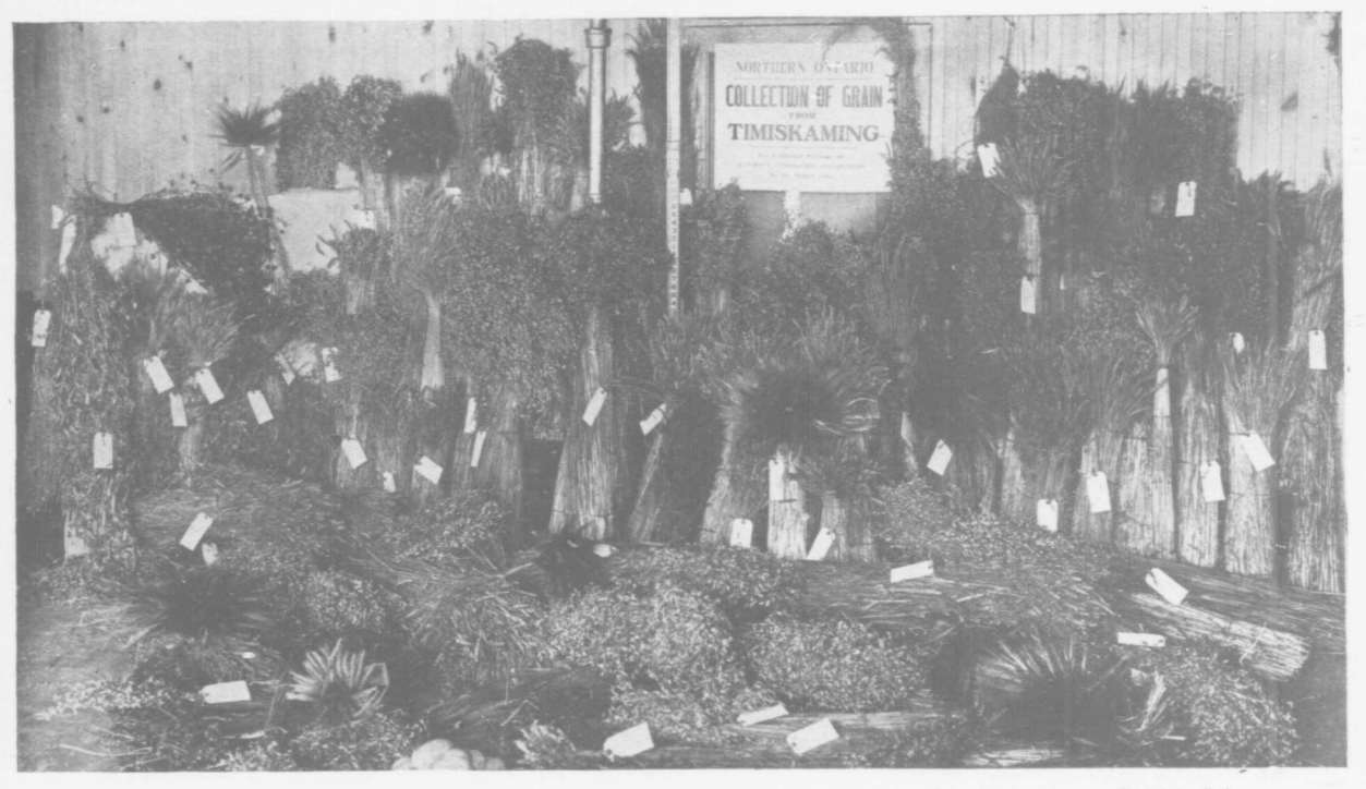
Collection of Grain from Timiskaming-For exhibition by Canadian Emigration Department, British Isles.