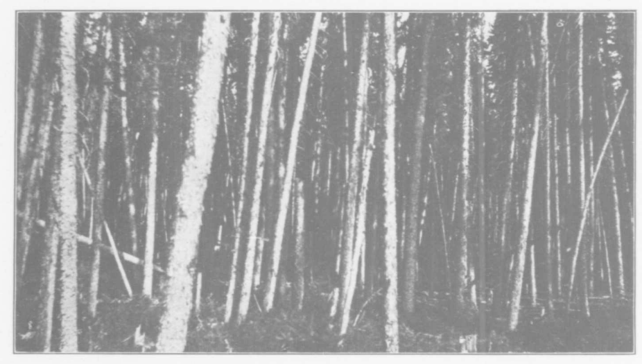
Pulpwood-Small bent tree at extreme right is 4 inches in diameter.