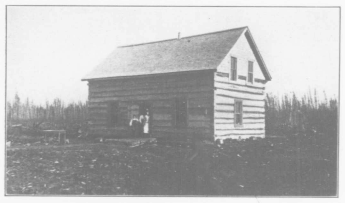
A settler's first attempt at house-building.