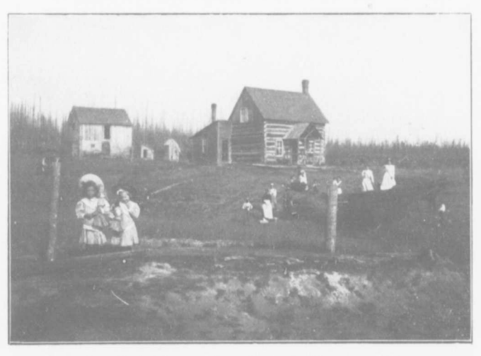
Geo. Males' home after the fire. (See page 36.)