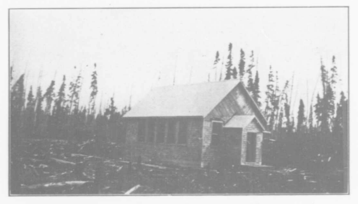
School House, 10 miles west of Matheson. (See page 42.)