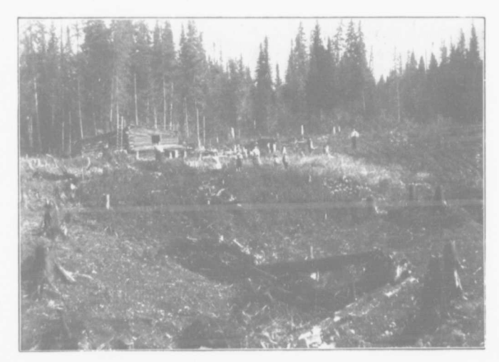
Clearing-Geo. Males-near Uno Park. (See page 36.)