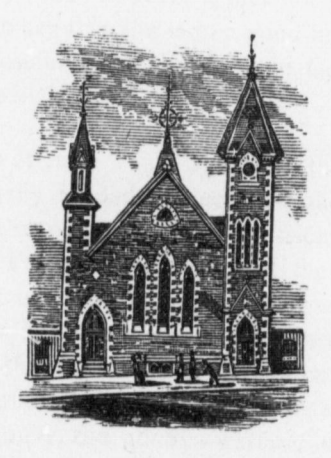
FRENCH BAPTIST CHURCH, -L'ORATOIRE, MANCE STREET, MONTREAL.

G BECCOSEDANDED BEDERE DAS DE REPRESENTATION DE PROPERTADO DE PROPERTADO DE LA COMPANSIONA DE LA COMPANSIONA DE