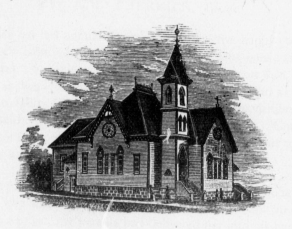
ROUSSY MEMORIAL BAPTIST CHURCH, GRANDE LIGNE, P.Q.

G BECCOSEDANDED BEDERE DAS DE REPRESENTATION DE PROPERTADO DE PROPERTADO DE LA COMPANSIONA DE LA COMPANSIONA DE