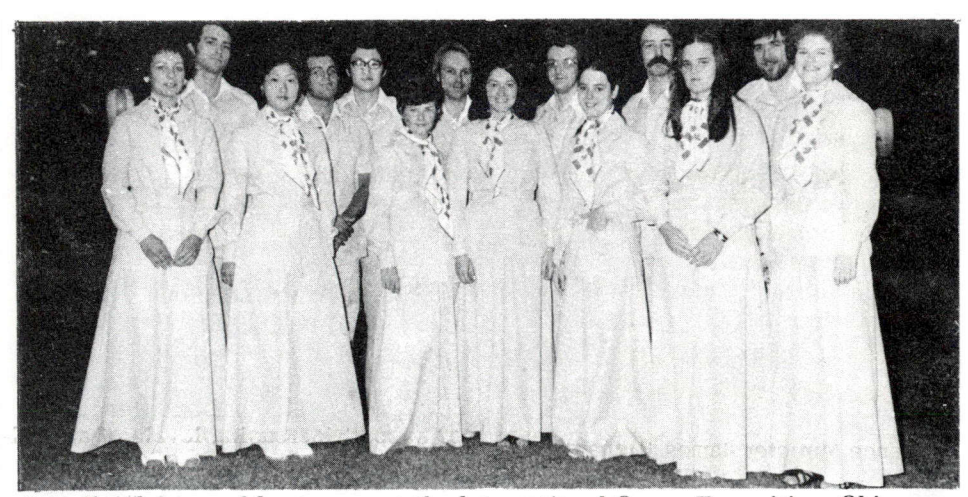
Canadian hosts and hostesses at the International Ocean Exposition, Okinawa.