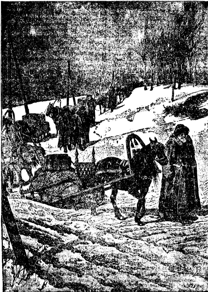
CARAVAN IN SIBERIA.

The skilful "steerer," charging with the men he had led, went across the ditch, up the embankment, and over the first line of earthworks. Then he fell, shot through the body. "Didn't I lead them straight, general?" he asked, as the commander-in-chief bent over him. When the pastor or Sunday-school teacher falls, how blessed is it to be able to appeal to our Great Leader with such confidence as this, knowing that the one end had been constantly in view. In Christian work let every one who has the guidance of others be sure to lead them straight.— Christian Inquirer.