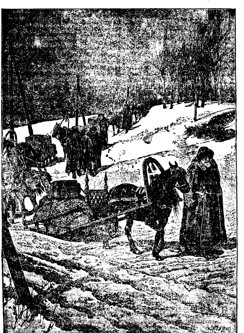
CARAVAN IN SIBERIA.

hands clasped behind his head, staring through the cigar smoke at the ceiling. The major was slowly looking the man