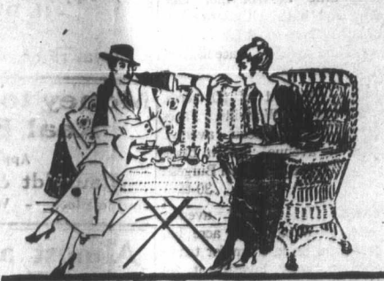
You see I had only a few thousand dollars left after the estate was settled—