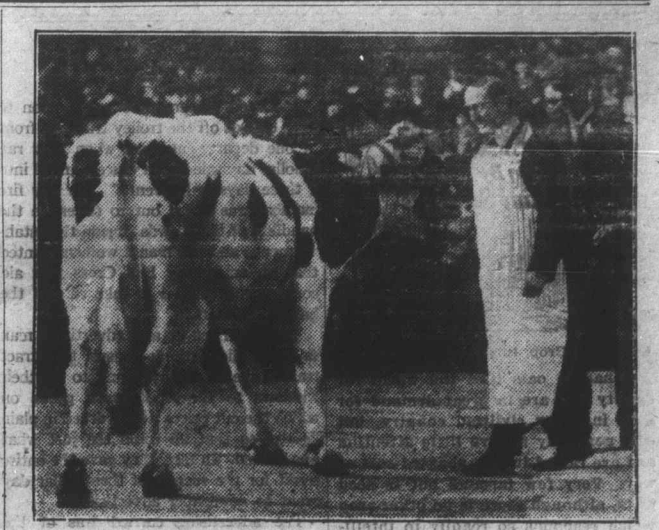
ONTARIO'S HIRED MAN