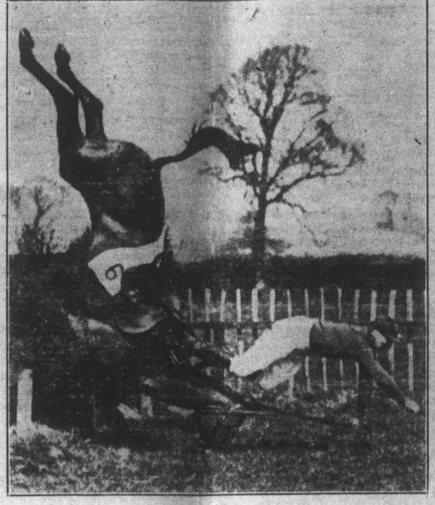
A FALL IN A STEEPLE CHASE

After this nasty spill on an English race course the jockey remounted his steed and rode home in second place.