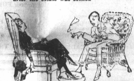
and my brother borrowed some to help him along: of course that went and then—