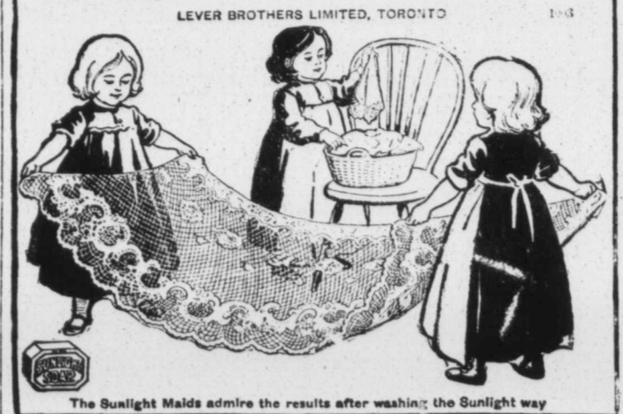
The Sunlight Maids admire the results after washing with the Sunlight way

You've probably used soap that cleaned your clothes quickly but have found out afterwards that it had destroyed them. Sunlight Soap is guaranteed to be absolutely pure, containing no ingredient that will injure the daintiest fabric. It washes equally well in hard or soft water without boiling or hard rubbing. Follow the directions on the package and you will have a more successful wash with less labor. Your dealer is authorized to refund the purchase money to anyone finding cause for complaint.