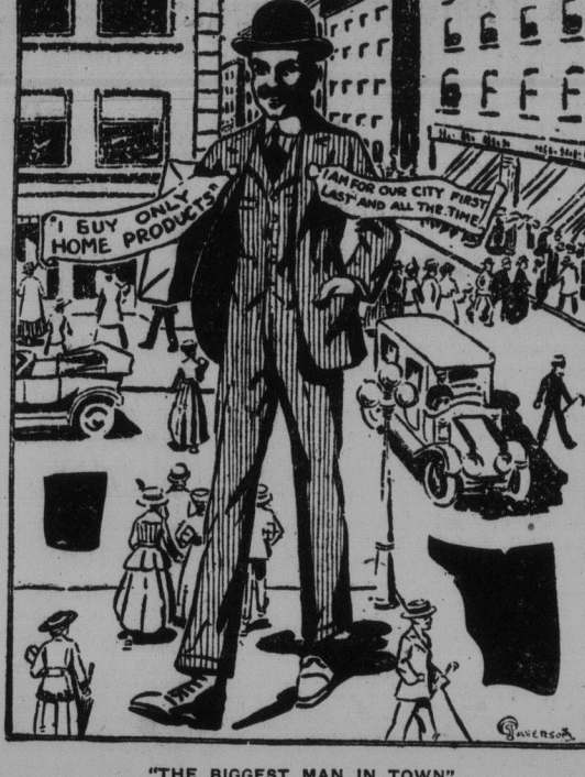
"THE BIGGEST MAN IN TOWN"

The man who is loyal enough, big enough and wise enough to confine his purchases to "home-made" goods is a man we can well be proud of. Every honest consumer must pat himself enthusiastically on the back when he spends his money in a way that, in supplying his own wants, he is helping to build up the community in which he lives.